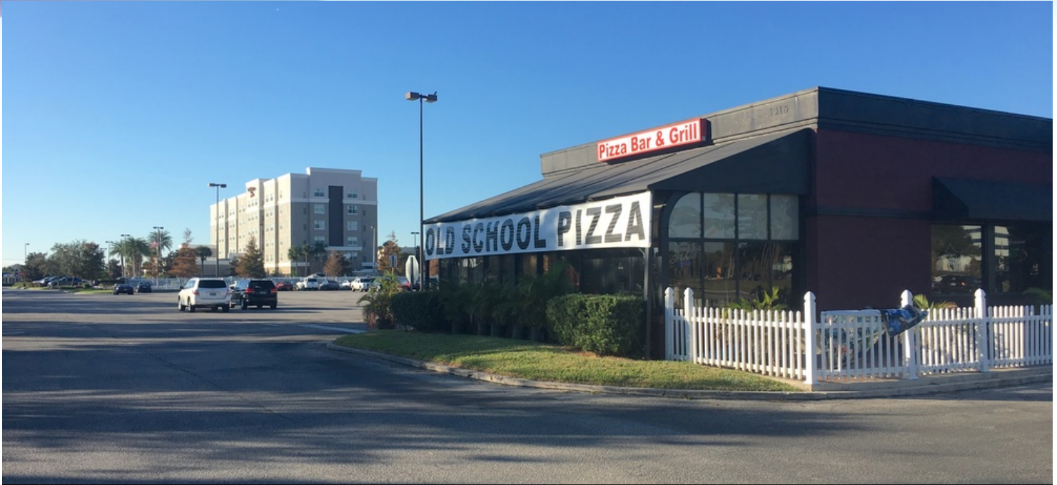
Highly Visible, Excellent Location for QSR, Marriott Residence Inn Immediately Nearby

• 1316 S Babcock Street Melbourne, FL 32901