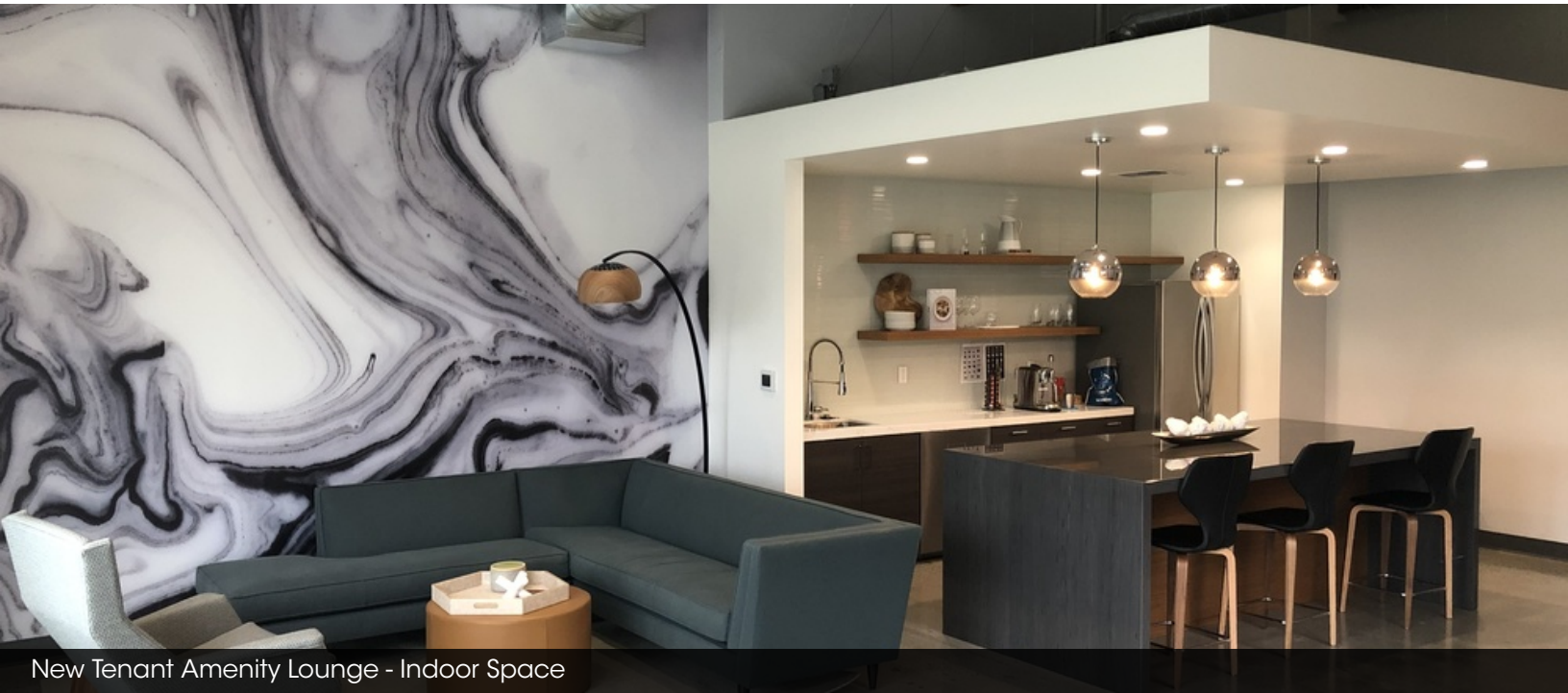
New Tenant Amenity Lounge - Indoor Space

8285 SW Nimbus Avenue, Beaverton, OR 97008