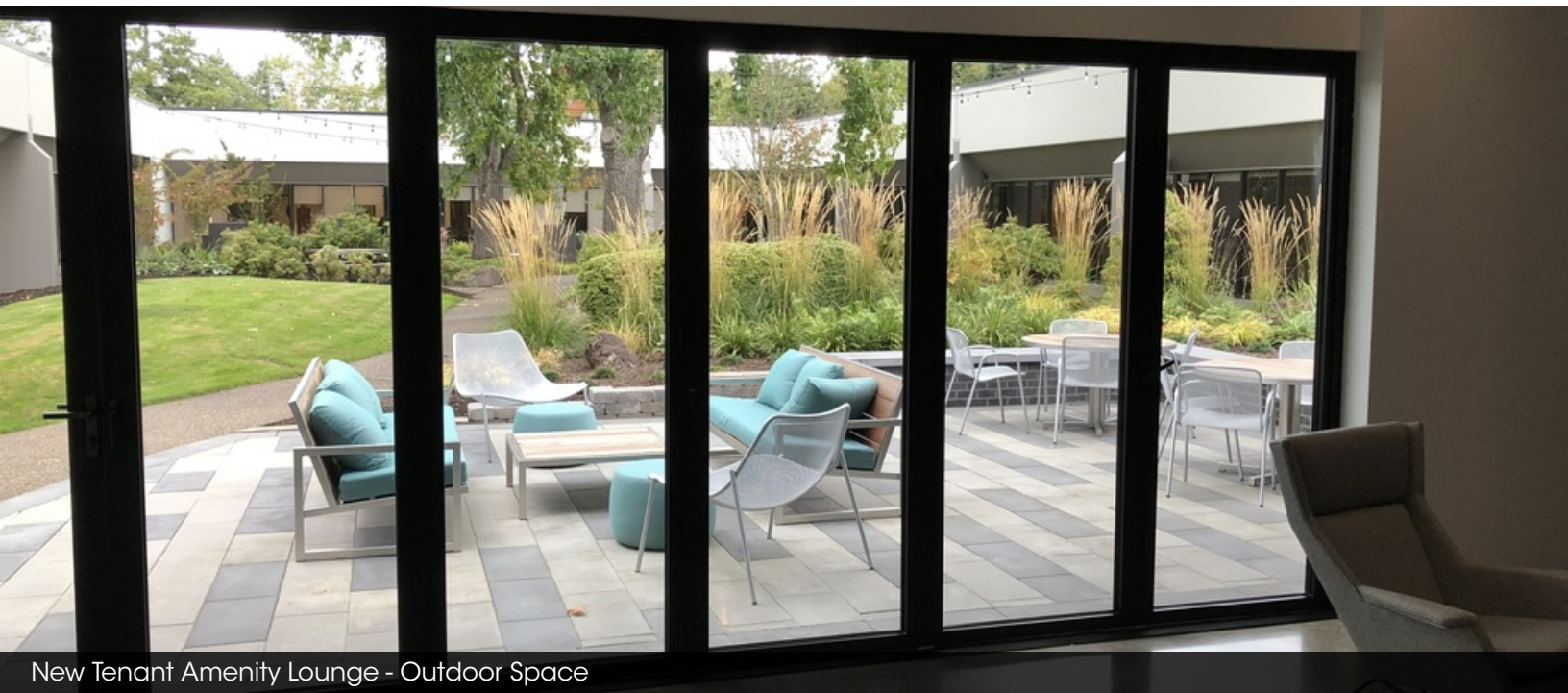
New Tenant Amenity Lounge - Outdoor Space