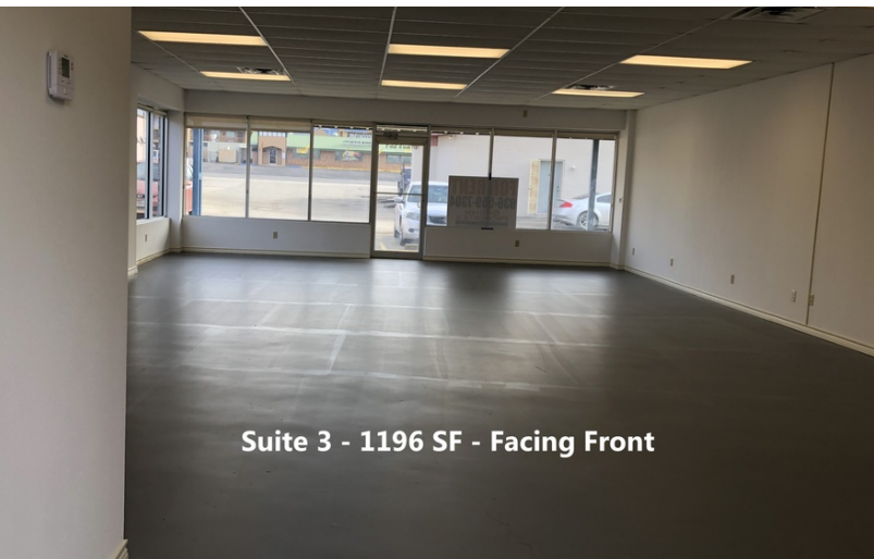
Suite 3 - 1196 SF - Facing Front