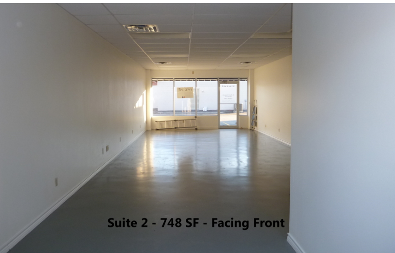
Suite 2 - 748 SF - Facing Front