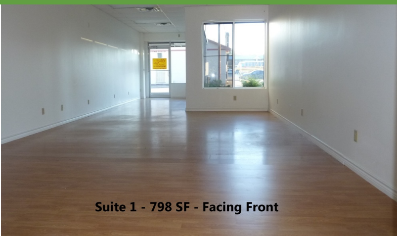
Suite 1 - 798 SF - Facing Front