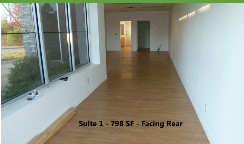
Suite 1 - 798 SF - Facing Rear