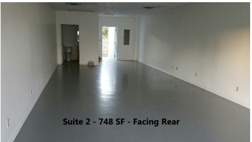
Suite 2 - 748 SF - Facing Rear