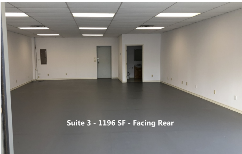
Suite 3 - 1196 SF - Facing Rear