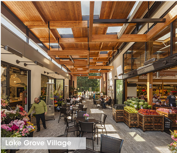
Lake Grove Village