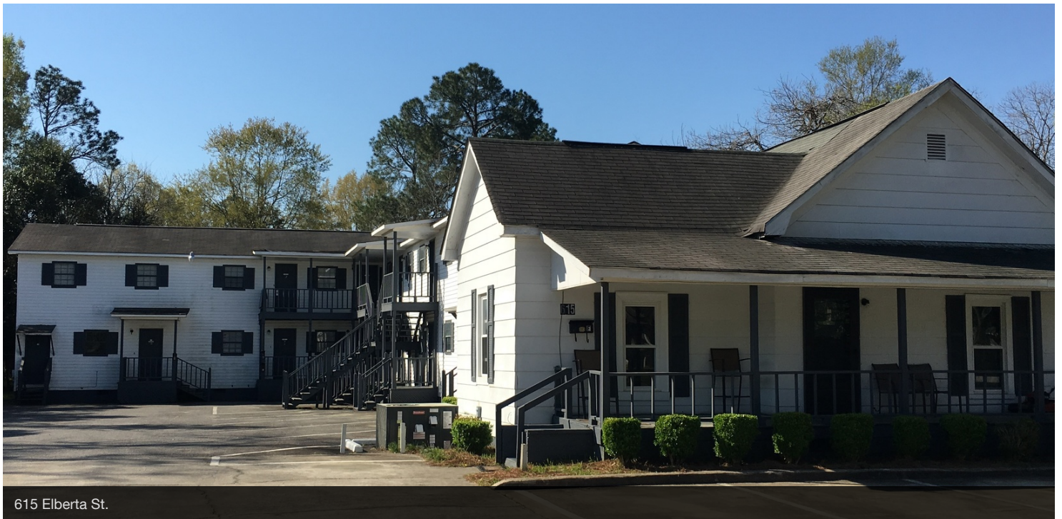
615 Elberta St.

KW COMMERCIAL 804 Town Blvd., Ste. A2040 Atlanta, GA 30319