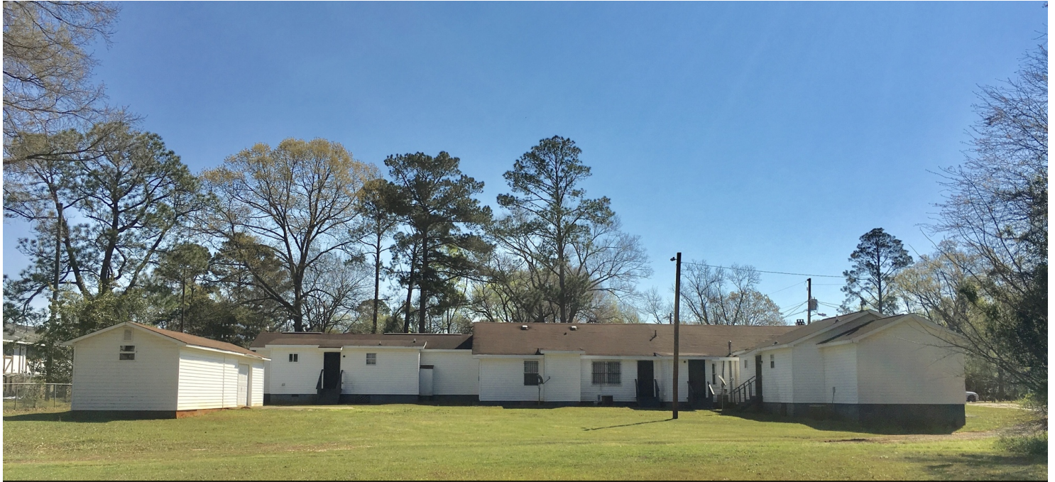
702 Elberta St.