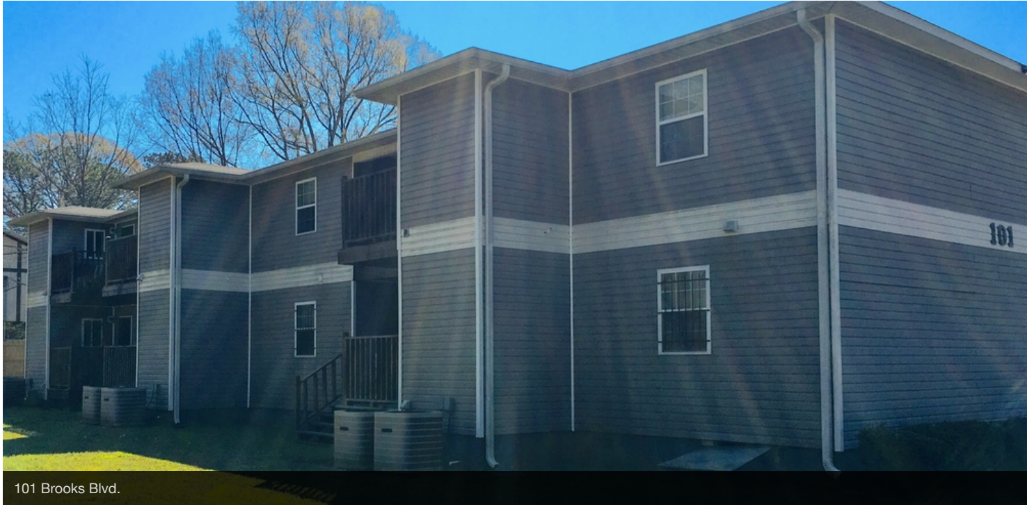
101 Brooks Blvd.