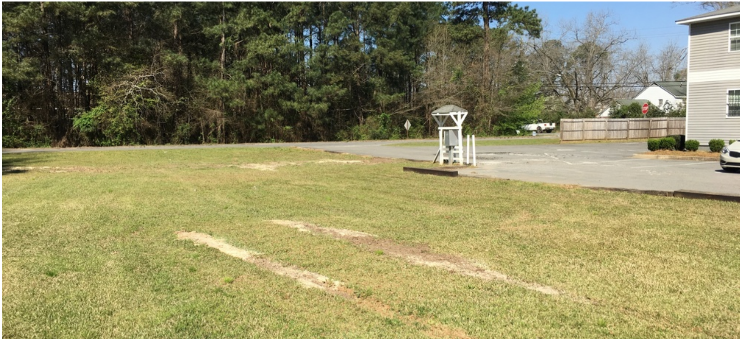
Development Opportunity for 4th Multi-Unit Building. Located next to 101 Brooks Blvd.

KW COMMERCIAL 804 Town Blvd., Ste. A2040 Atlanta, GA 30319