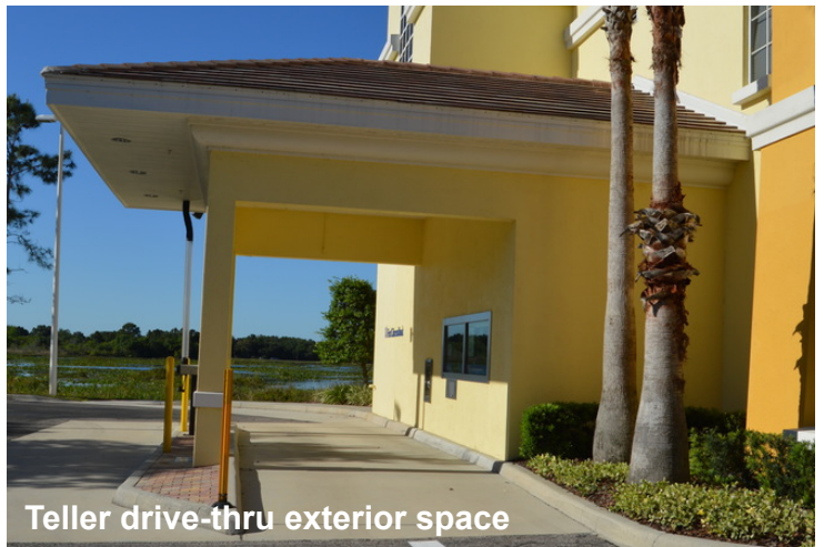
Teller drive-thru exterior space