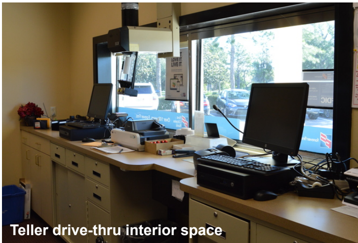
Teller drive-thru interior space