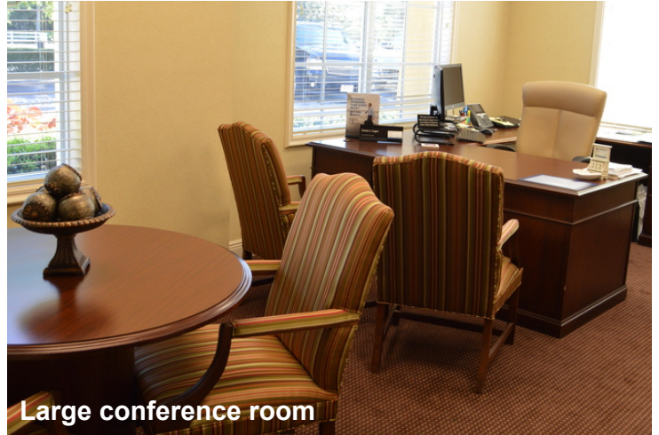
Large conference room