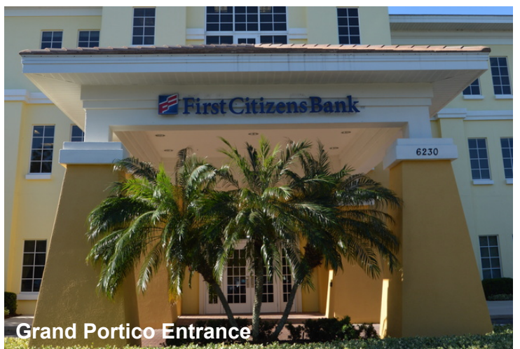
Grand Portico Entrance