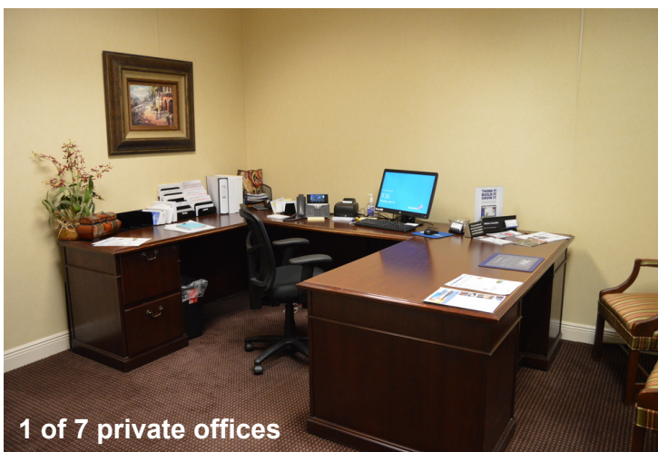
1 of 7 private offices