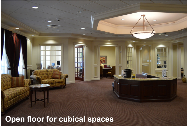
Open floor for cubical spaces