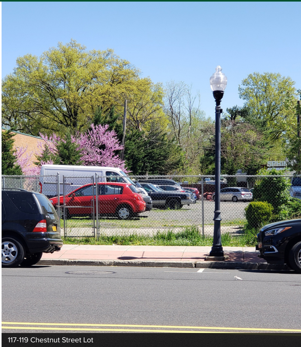
117-119 Chestnut Street Lot