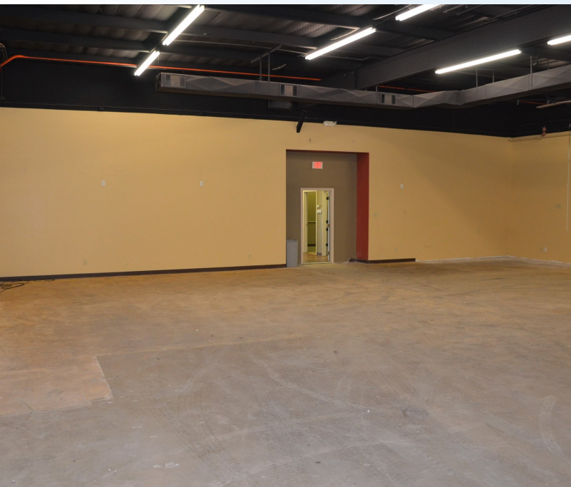
Suite A Warehouse