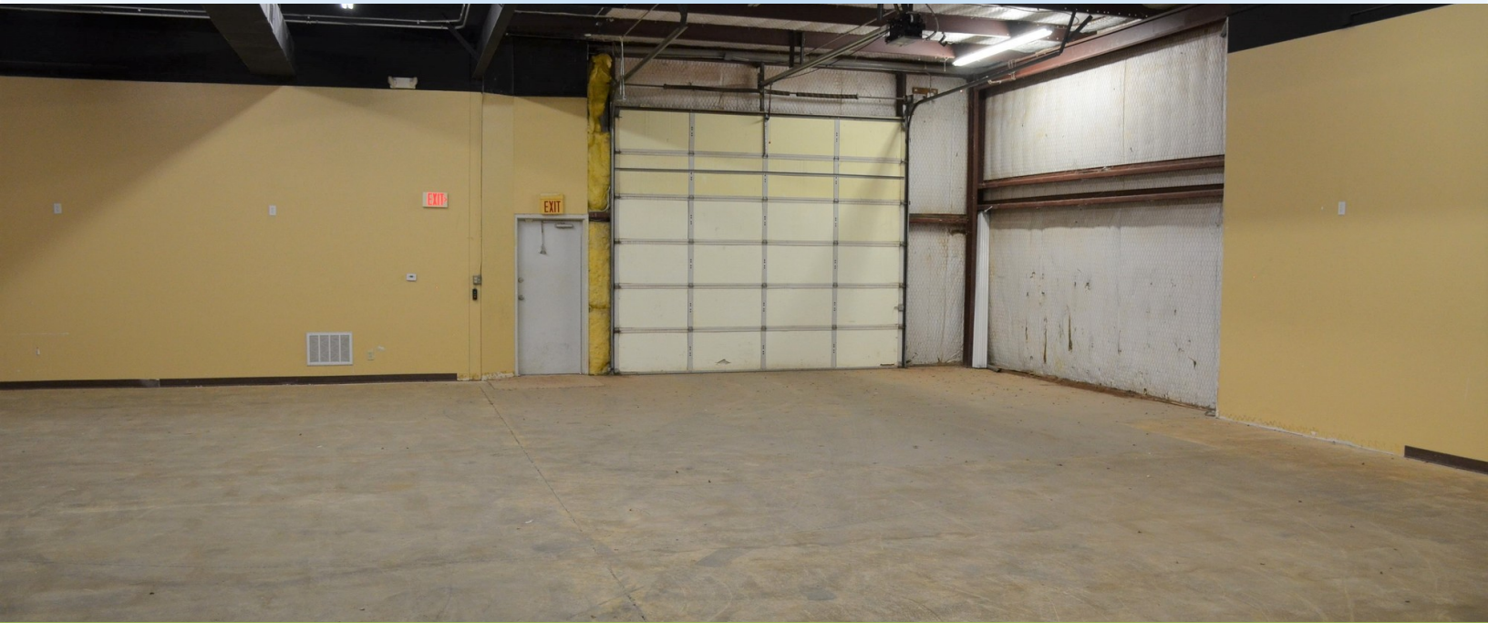
Suite A Warehouse