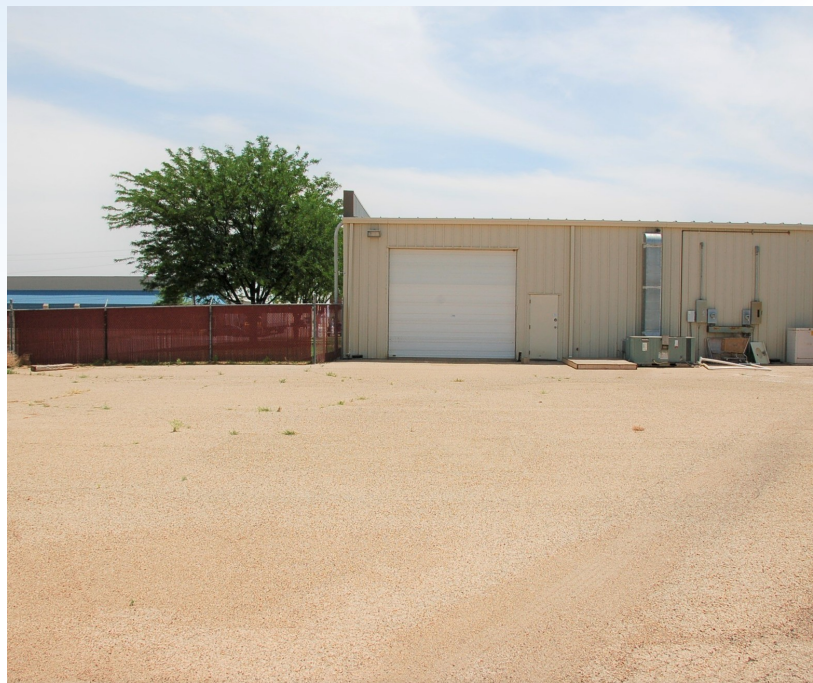
Suite A Fenced Stack Yard