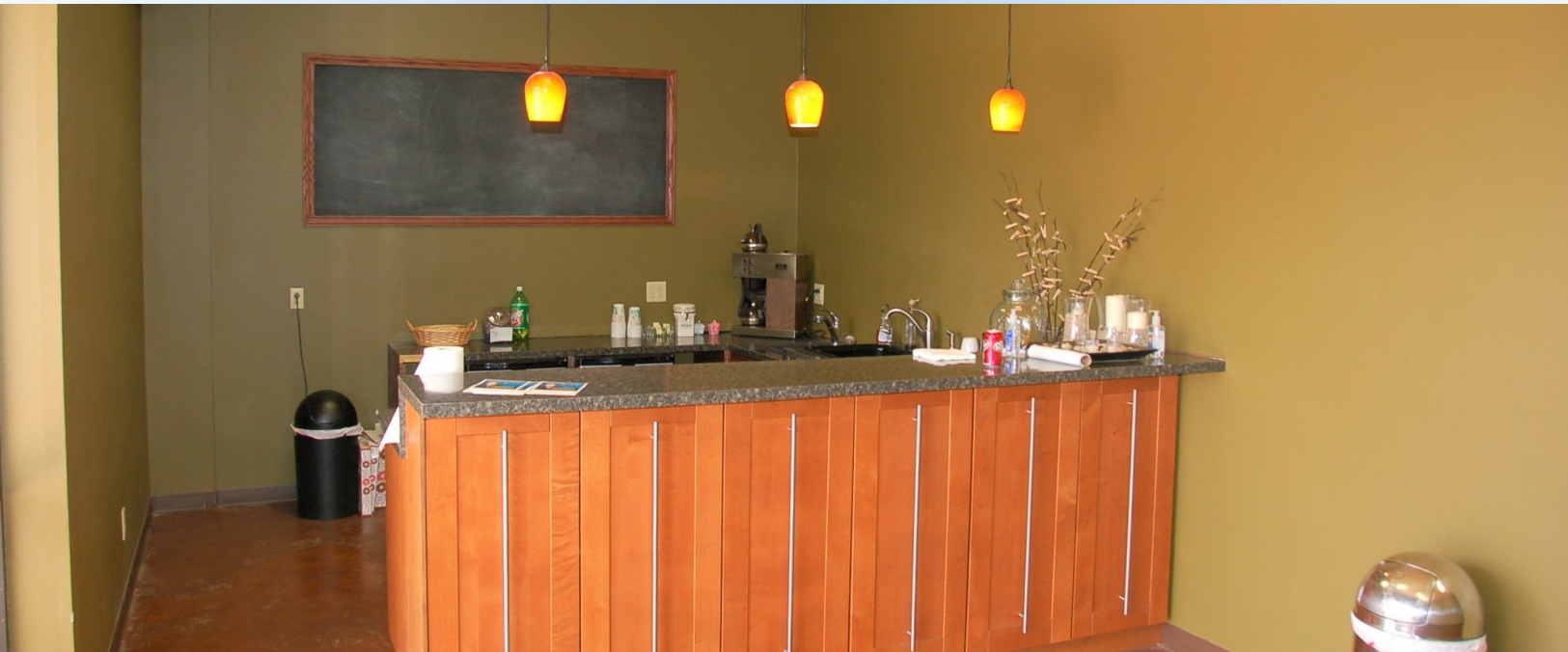
Suite A Entry