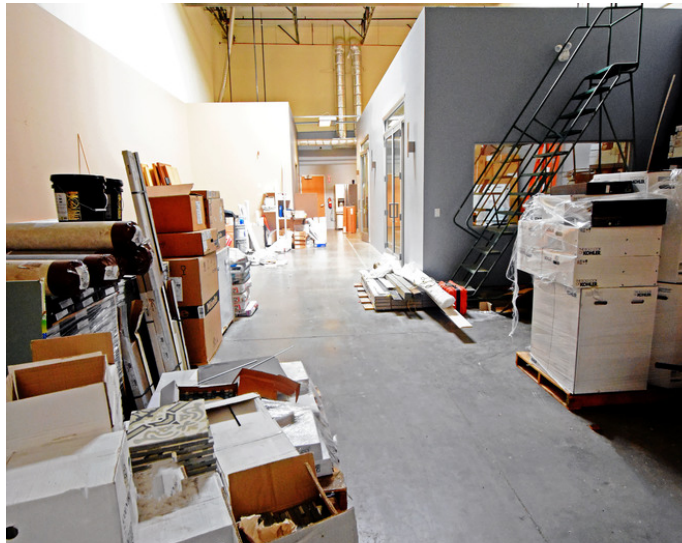
CalBRE# 02051182 Information has been secured from sources we believe to be reliable, however, WILSON MEADE cannot guarantee its accuracy.