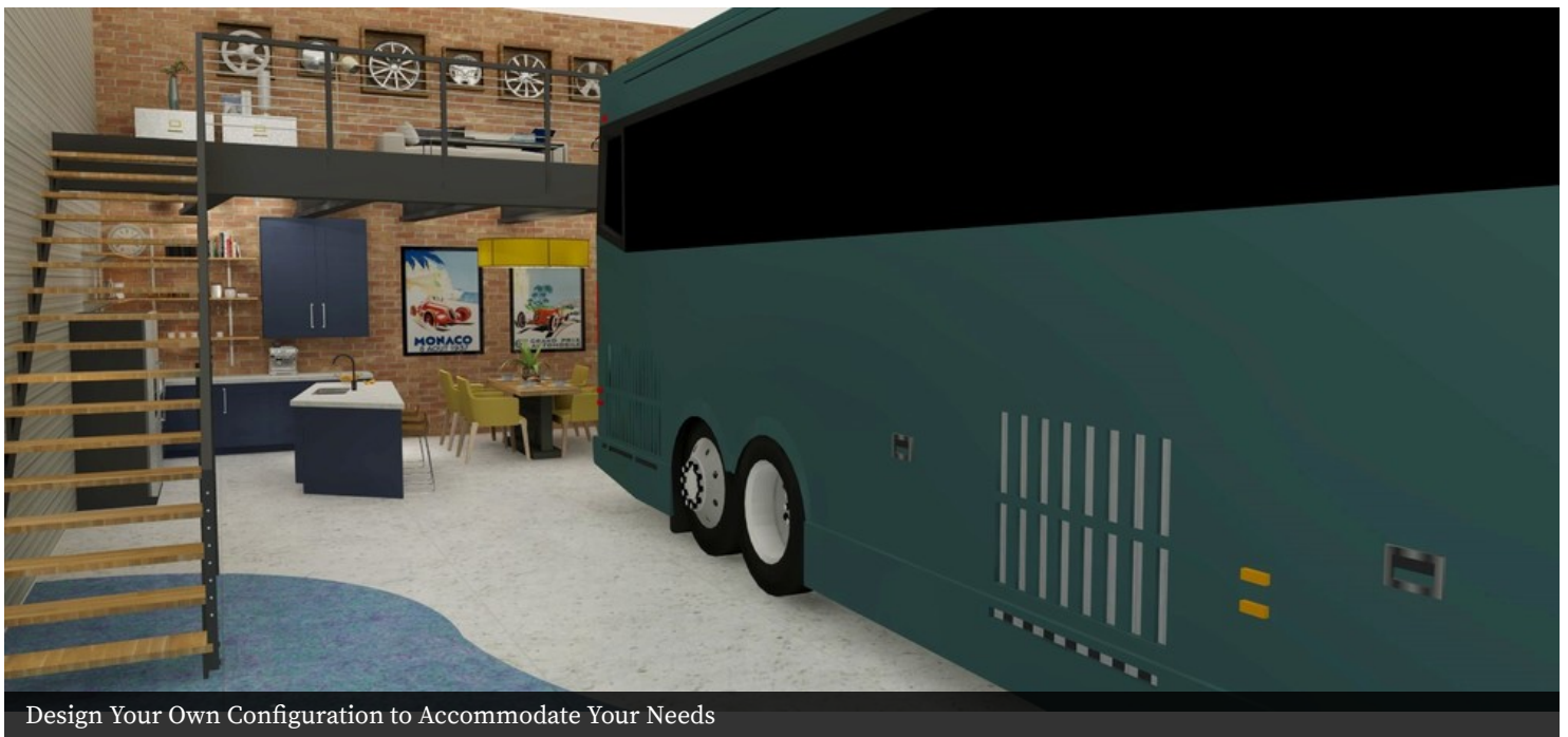
Design Your Own Configuration to Accommodate Your Needs