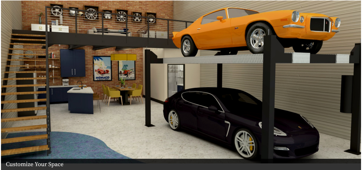
Customize Your Space