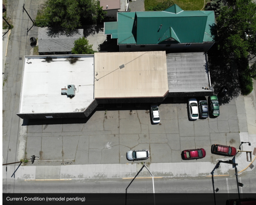
Current Condition (remodel pending)