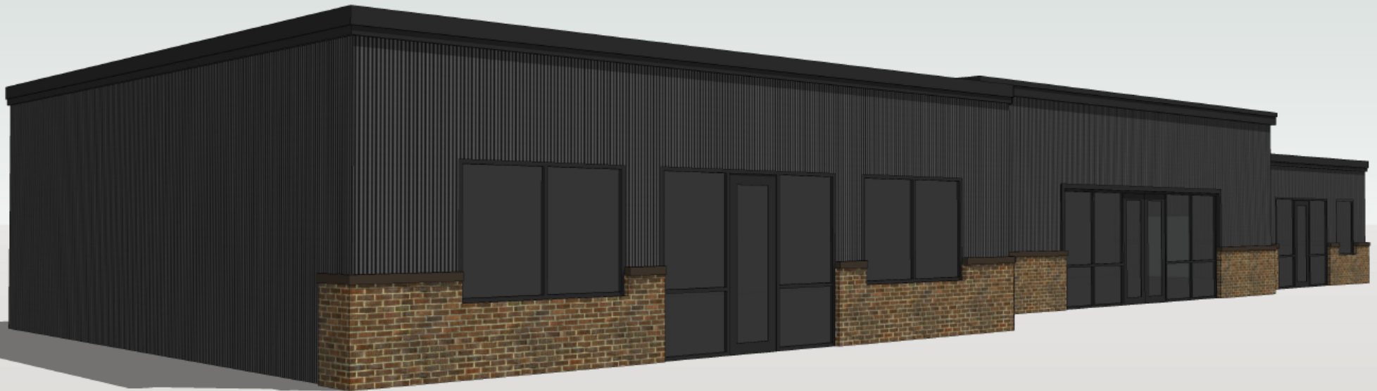
Proposed Exterior Finishes

No Warranty Or Representation, Express Or Implied, Is Made As To The Accuracy Of The Information Contained Herein, And The Same Is Submitted Subject To Errors, Omissions, Change Of Price, Rental Or Other Conditions, Prior Sale, Lease Or Financing, Or Withdrawal Without Notice, And Of Any Special Listing Conditions Imposed By Our Principals No Warranties Or Representations Are Made As To The Condition Of The Property Or Any Hazards Contained Therein Are Any To Be Implied.