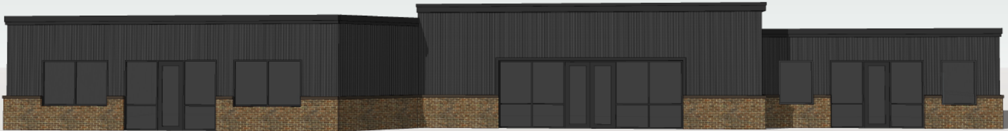
Proposed Exterior Finishes