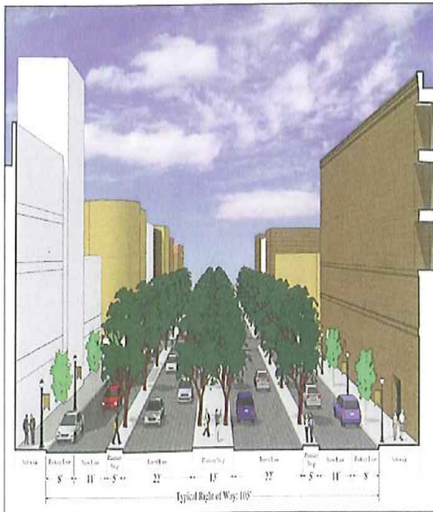
Harkrider Boulevard Proposed Section Studio