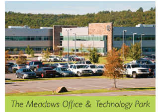
The Meadows Office & Technology Park

In 2025, Conway has transportation infrastructure that is attractive to prospective employers from a capacity, engineering and aesthetic standpoint.