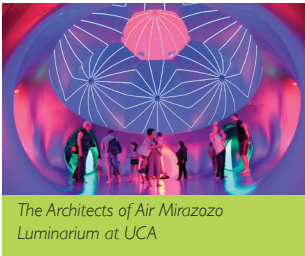
The Architects of Air Mirazozo Luminarium at UCA