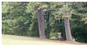
Beaverfork Disc Golf Range