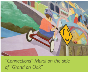
"Connections" Mural on the side of "Grand on Oak"