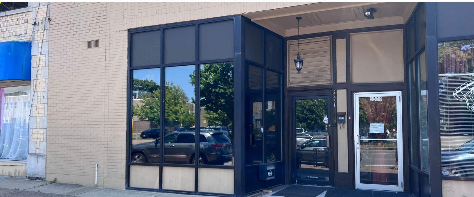
Updated exterior for space