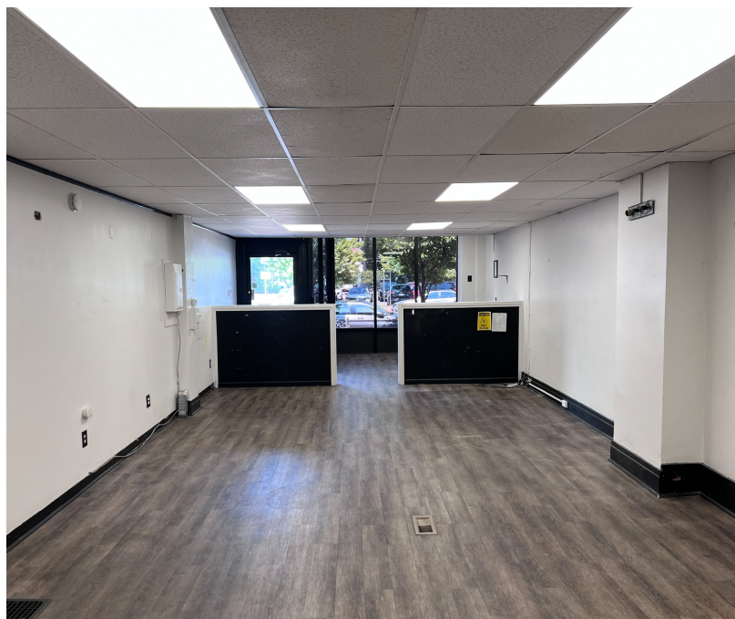
Space is in vanilla condition