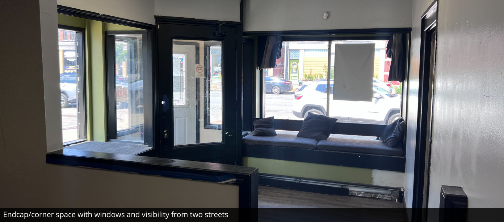
Endcap/corner space with windows and visibility from two streets