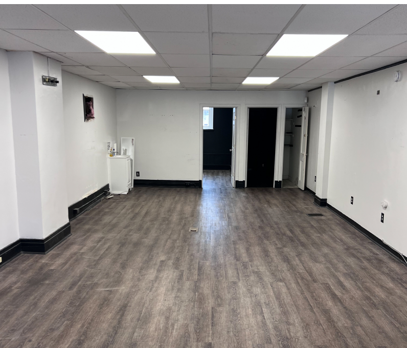
Open sales/retail floor