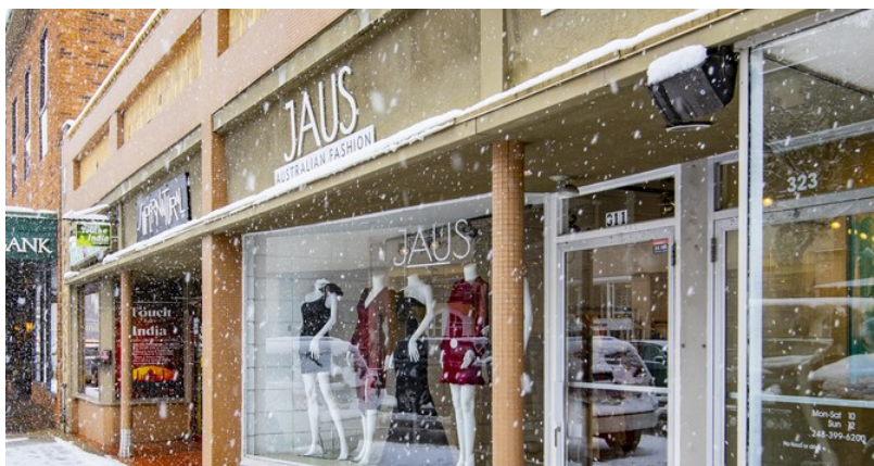
Add text here...