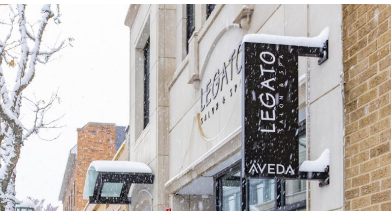
Add text here...