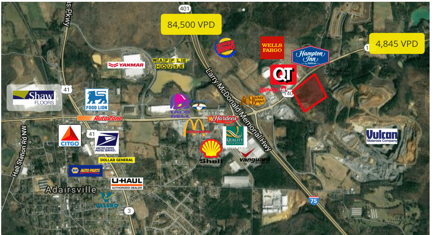
Topography Map - Location Approximate

MICHAEL WESS, CCIM | 404-876-1640 x150 | MWess@BullRealty.com