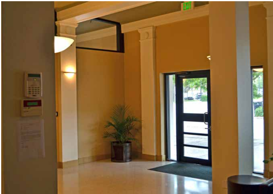
141 5th ST NW Main Entrance