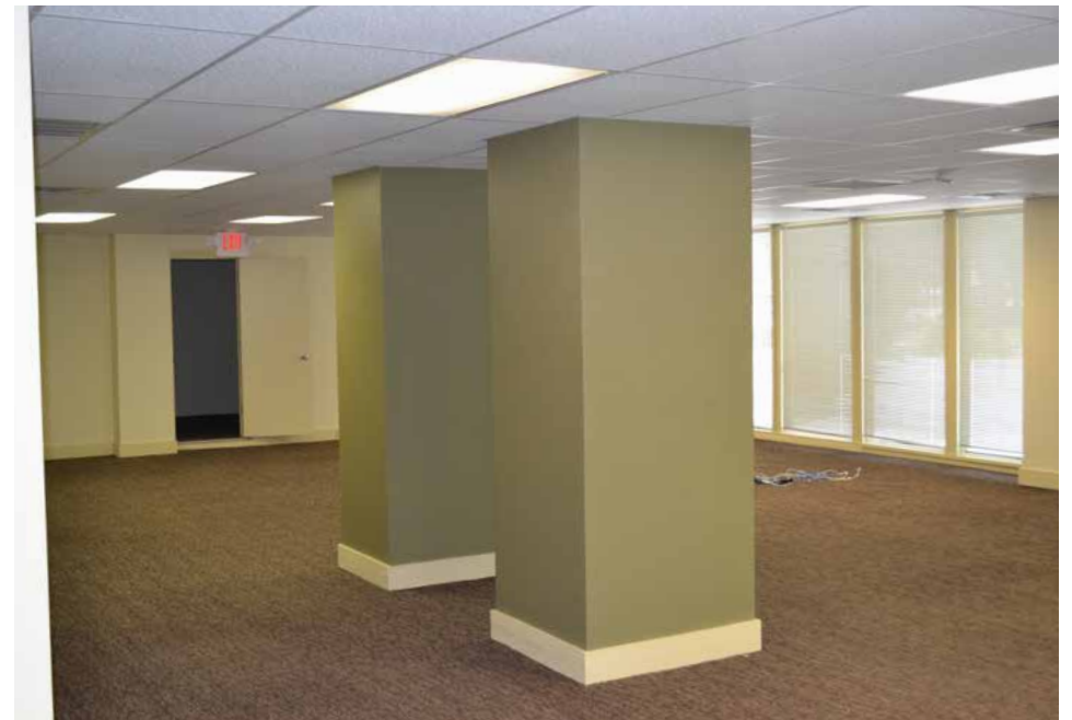
505 Avenue A NW Office Space