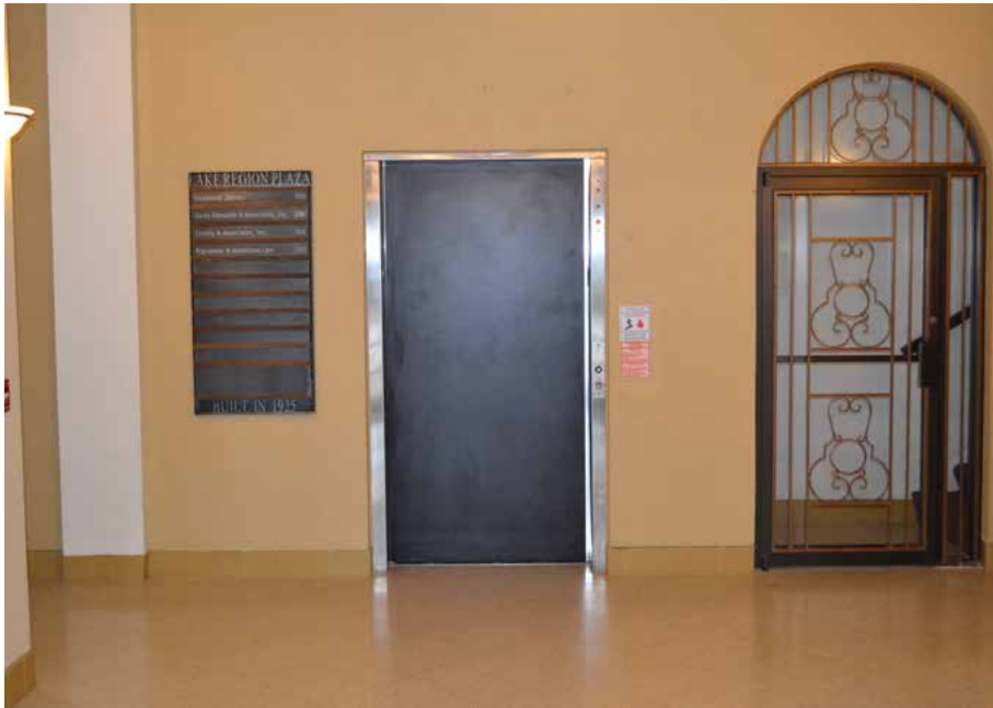
141 5th ST NW Elevator