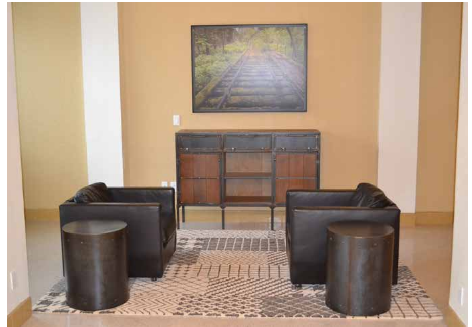
141 5th ST NW Lobby