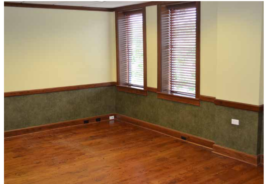
141 5th ST NW Office Space