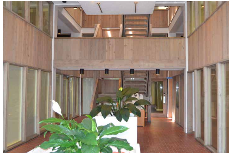
505 Avenue A NW Common Area