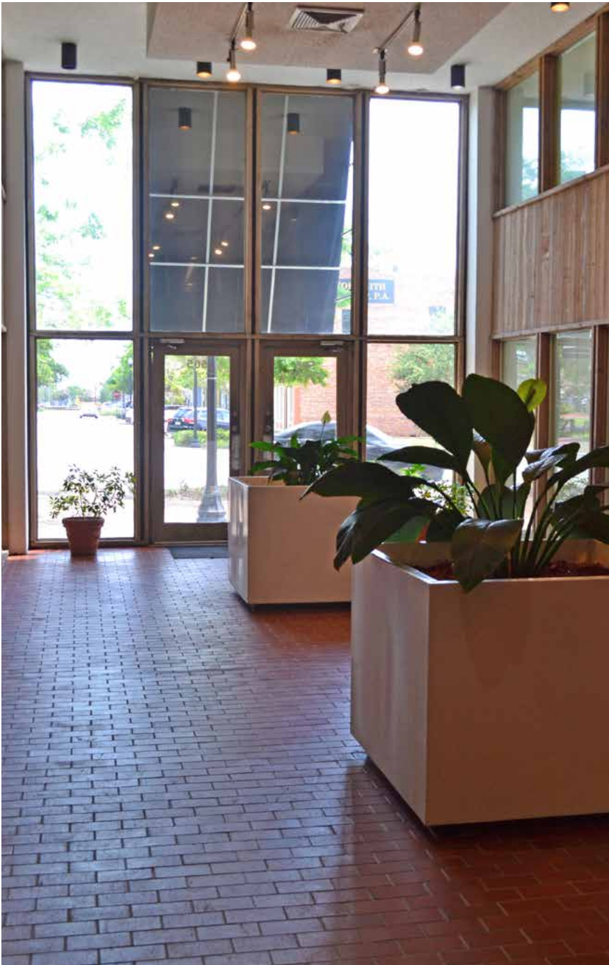
505 Avenue A NW Office Lobby