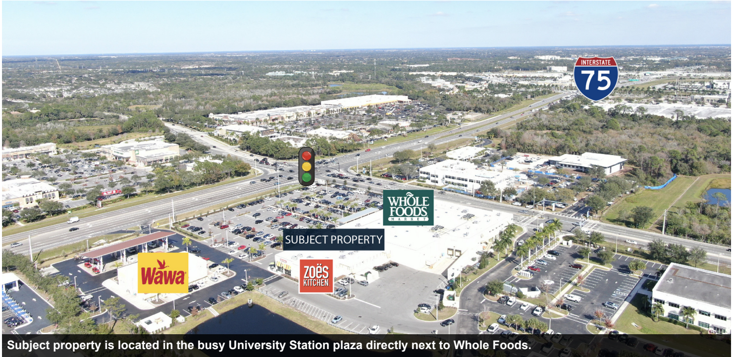
Subject property is located in the busy University Station plaza directly next to Whole Foods.

5268 University Parkway, Sarasota, FL 34243