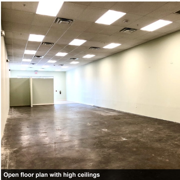
Open floor plan with high ceilings