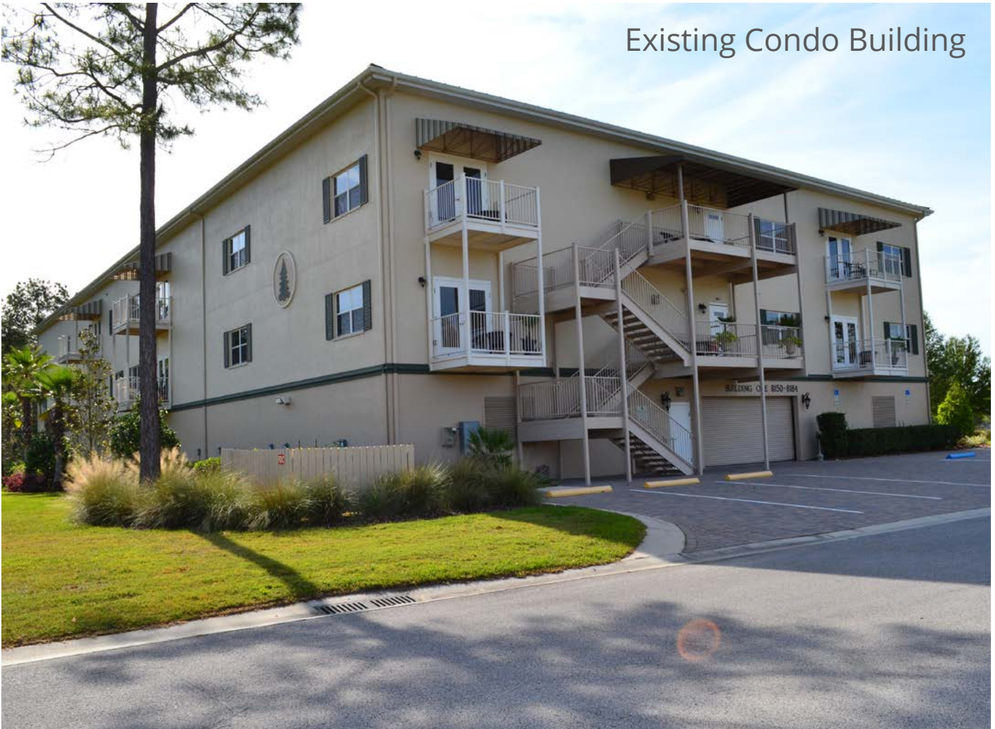
Existing Condo Building