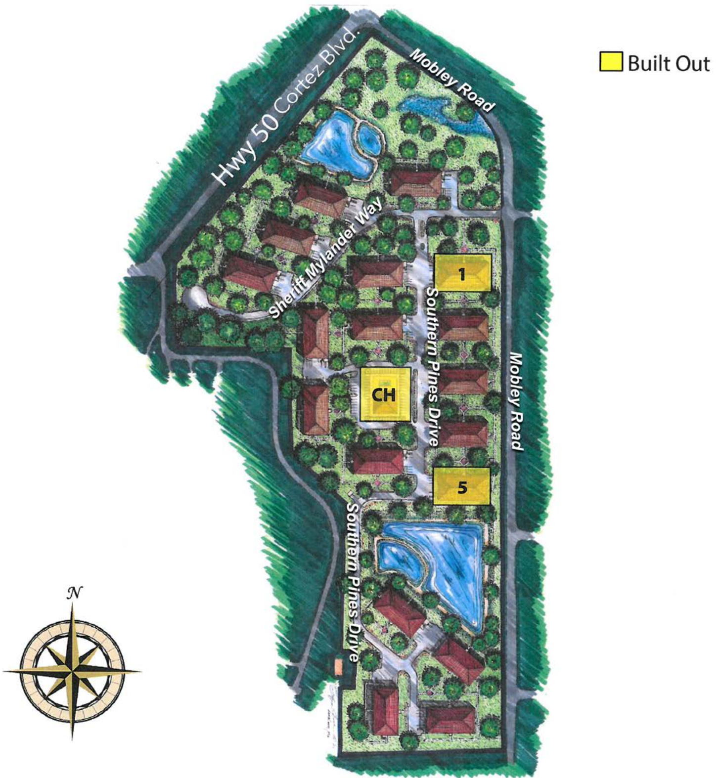
Southern Pines Development Site Plan