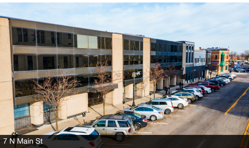
7 N Main St