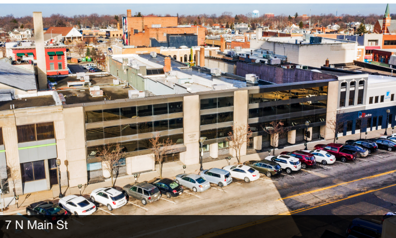
7 N Main St