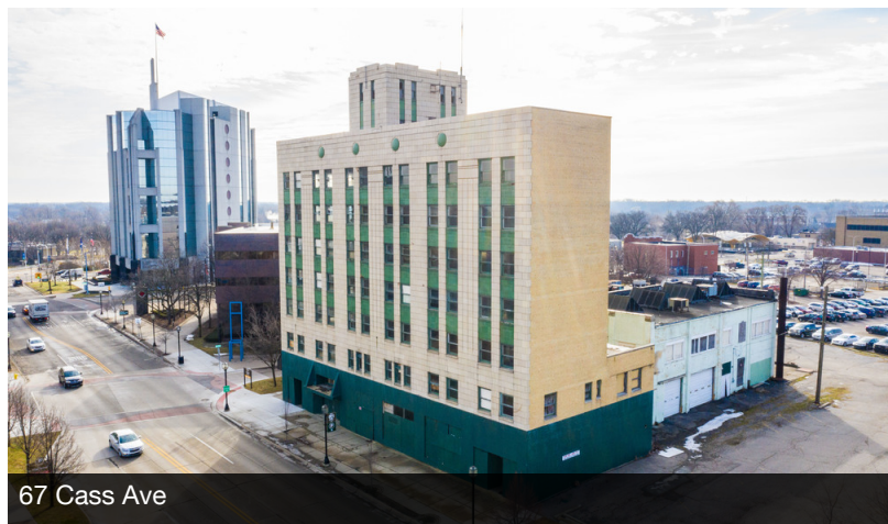
67 Cass Ave