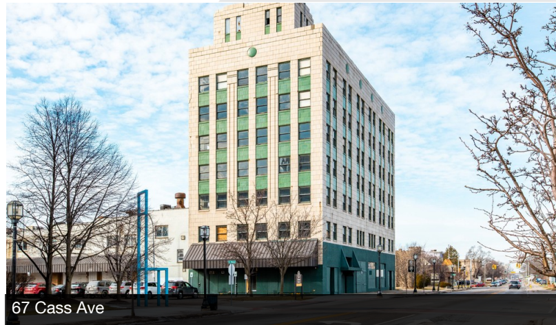
67 Cass Ave