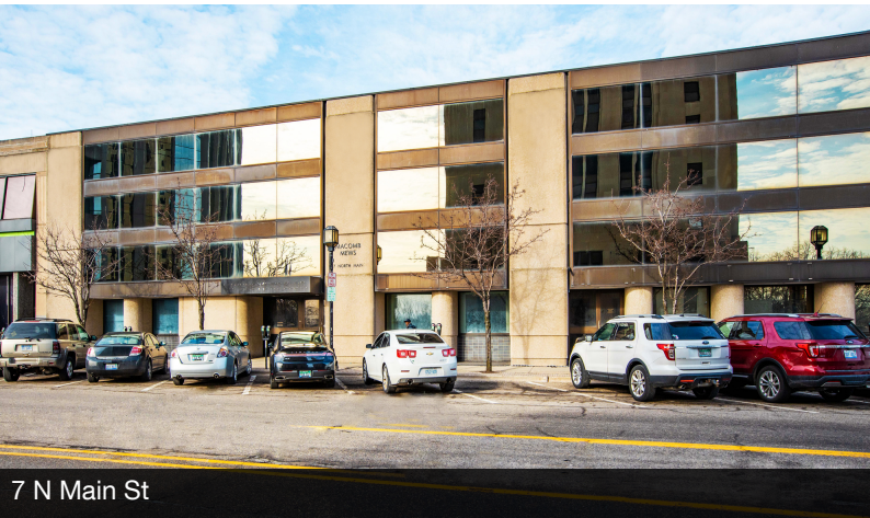
7 N Main St