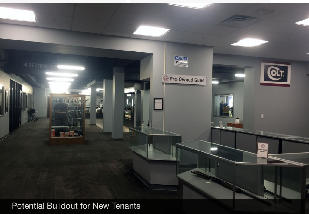
Potential Buildout for New Tenants