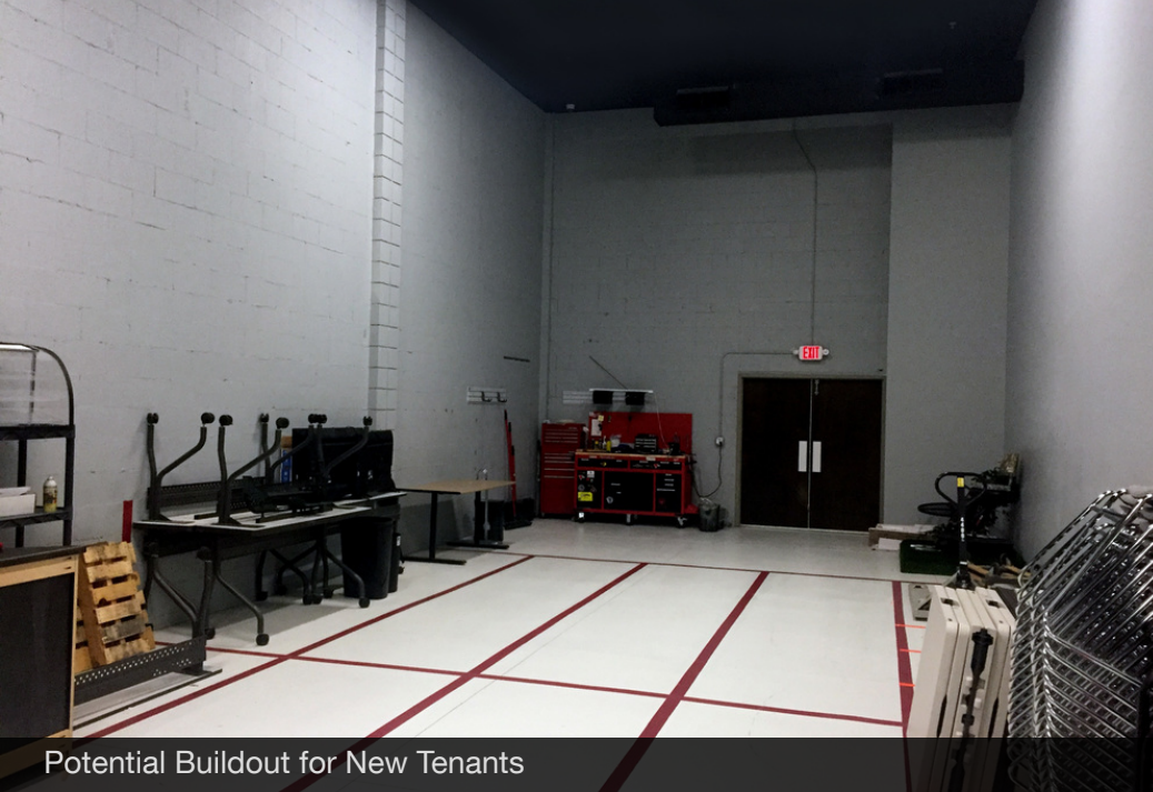
Potential Buildout for New Tenants