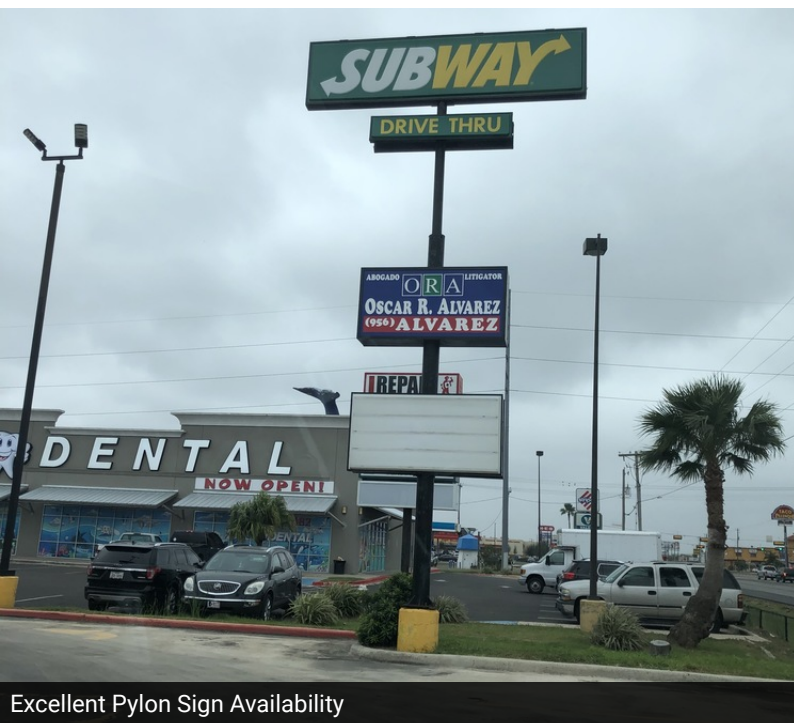
Excellent Pylon Sign Availability