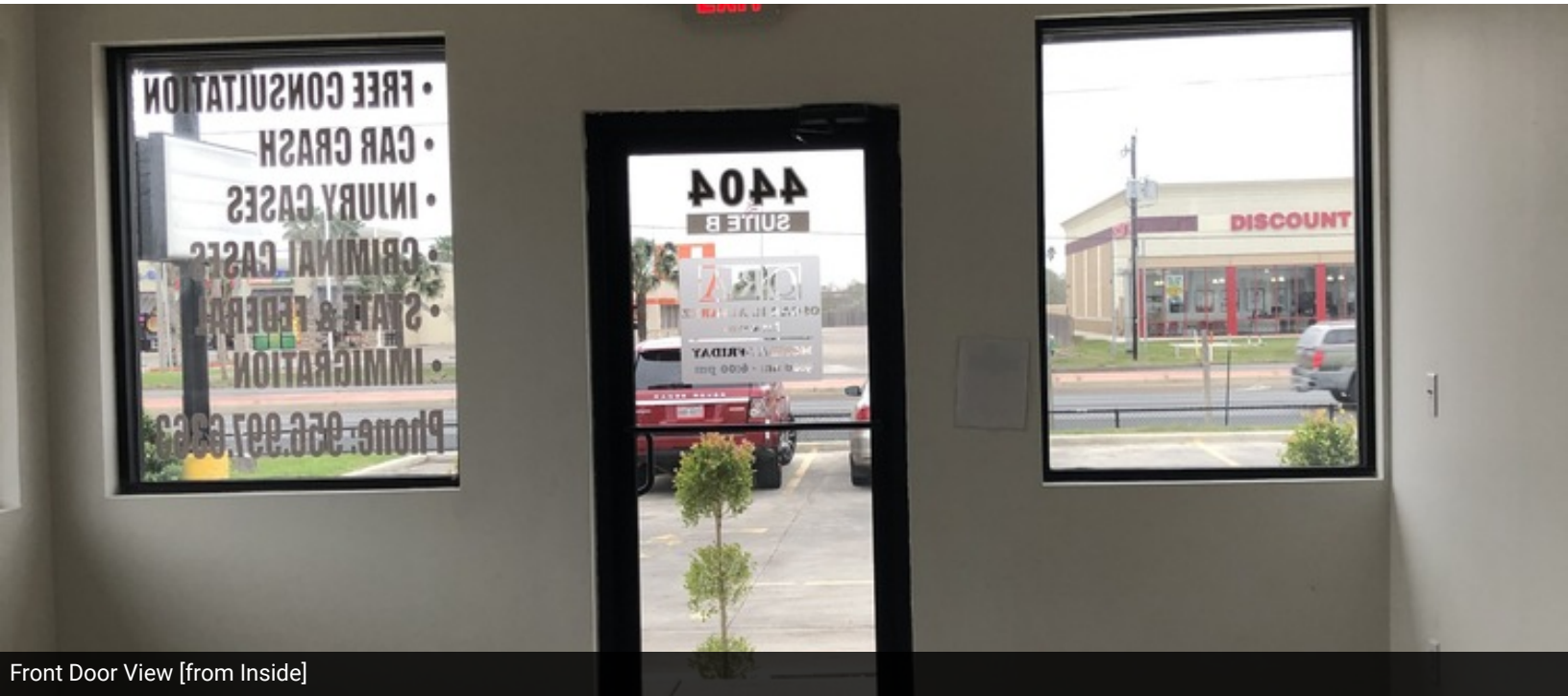
Front Door View [from Inside]