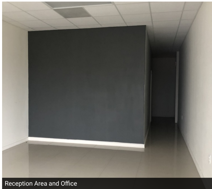
Reception Area and Office