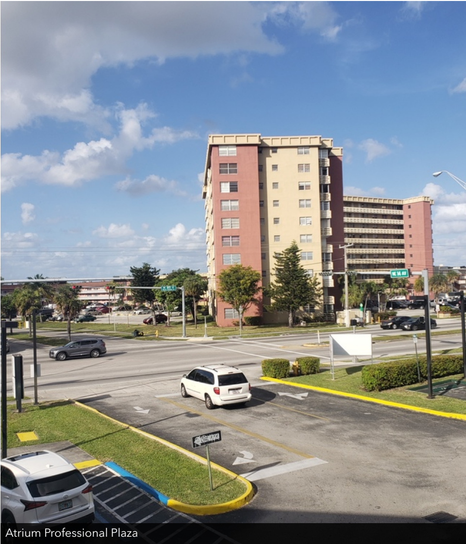
Atrium Professional Plaza