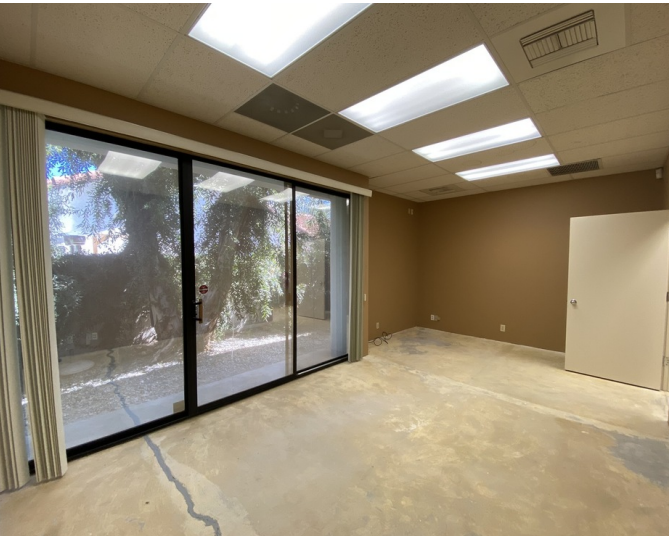
CalBRE# 02051182 Information has been secured from sources we believe to be reliable, however, WILSON MEADE cannot guarantee its accuracy.