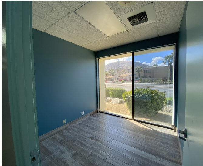
CalBRE# 02051182 Information has been secured from sources we believe to be reliable, however, WILSON MEADE cannot guarantee its accuracy.

FOR MORE INFORMATION CONTACT: MATT RIFKIN