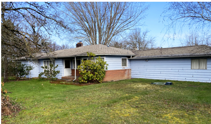
House - Tear Down