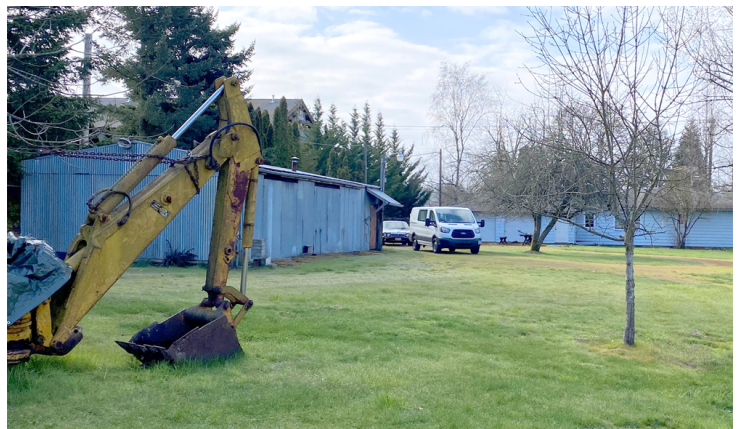
Small Pole Barn - Tear Down

KW PORTLAND PREMIERE KELLERWILLIAMS, REALTY