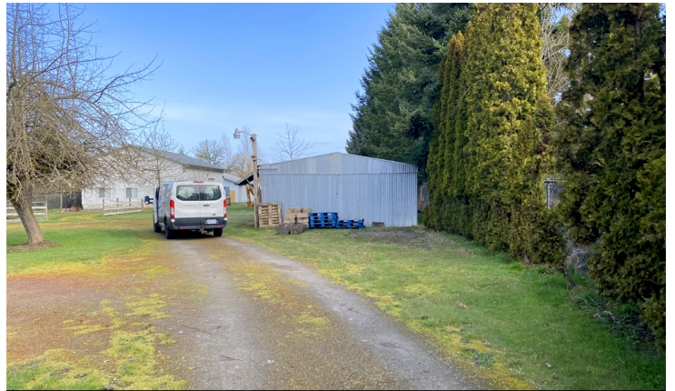
Driveway To Out Buildings