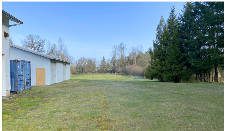
Large Pole Barn