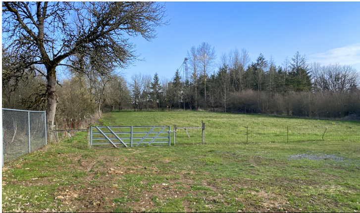
Open Land Behind Shop