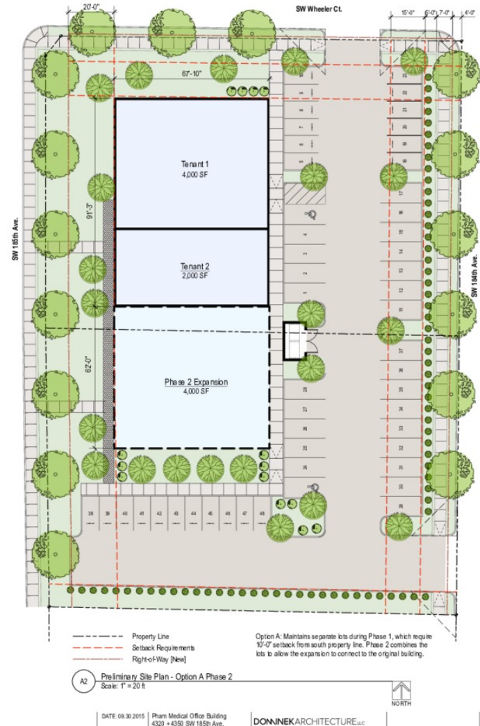
Building plans can be purchased from seller for an additional cost.