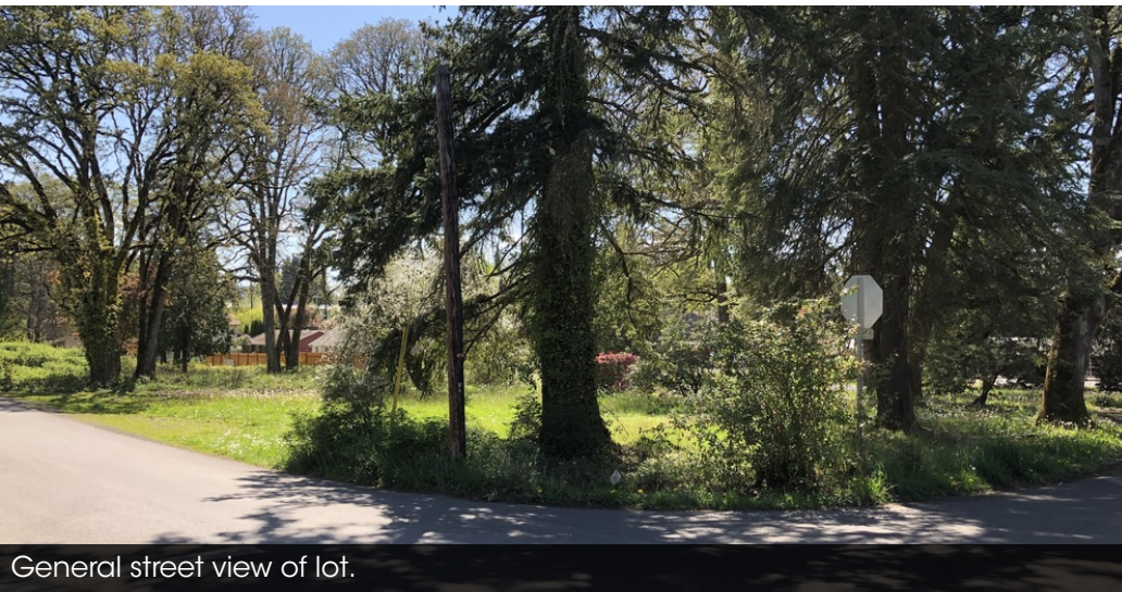
General street view of lot.