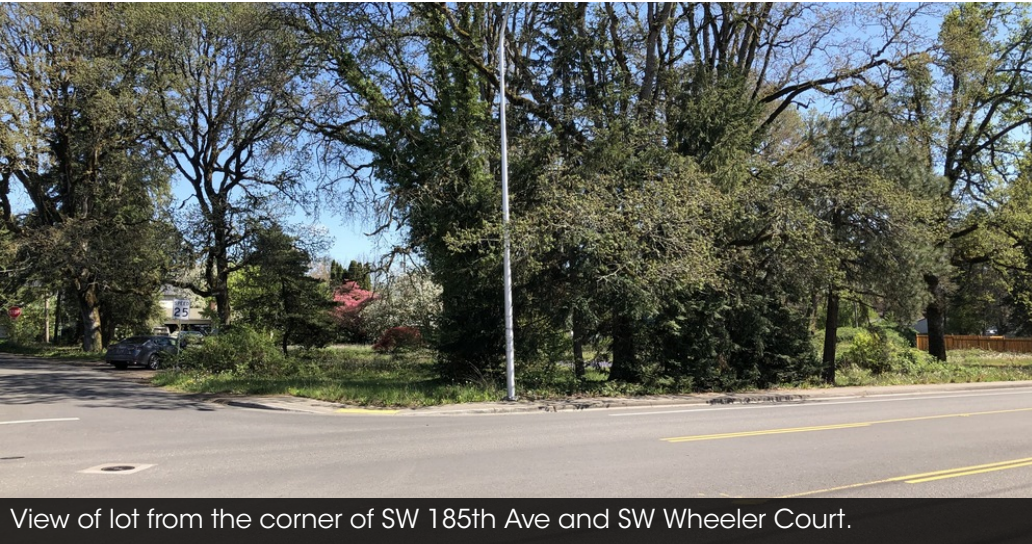
View of lot from the corner of SW 185th Ave and SW Wheeler Court.