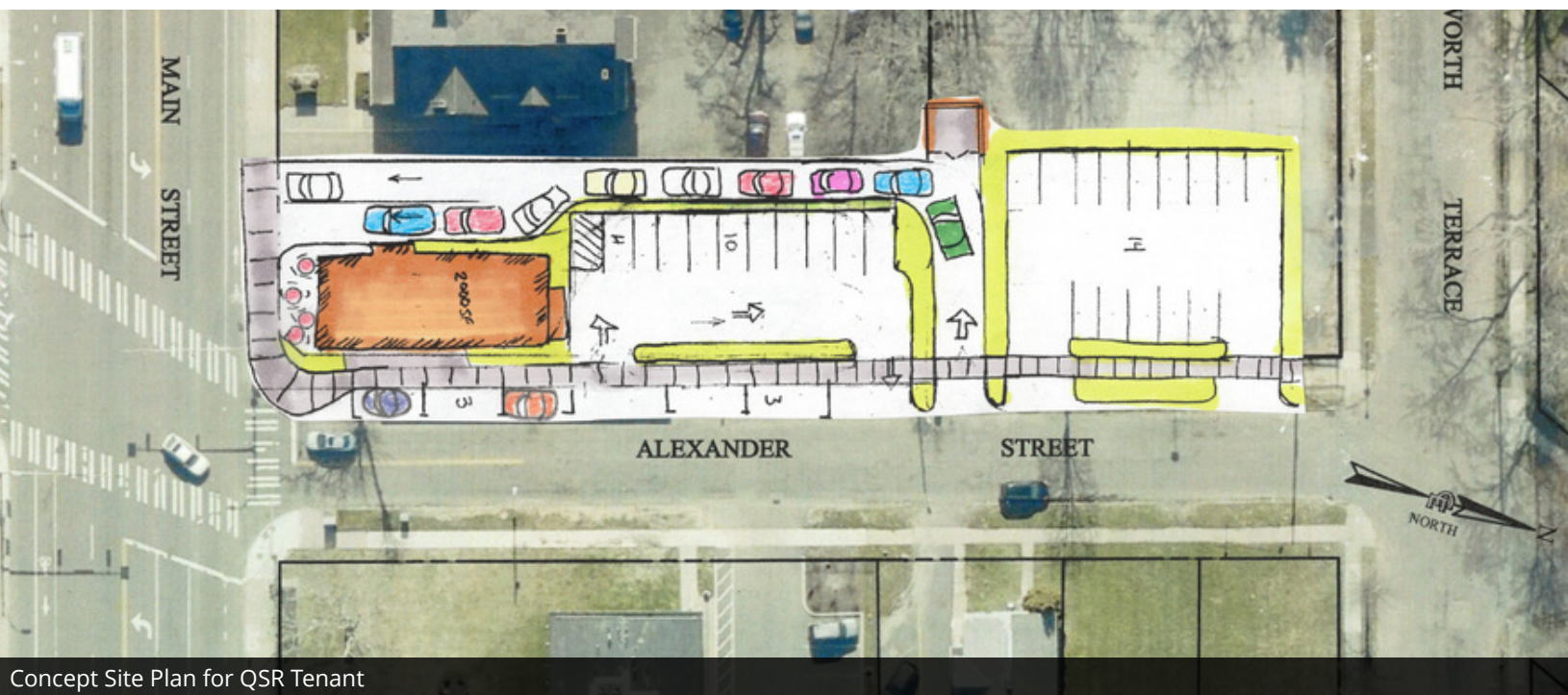
Concept Site Plan for QSR Tenant