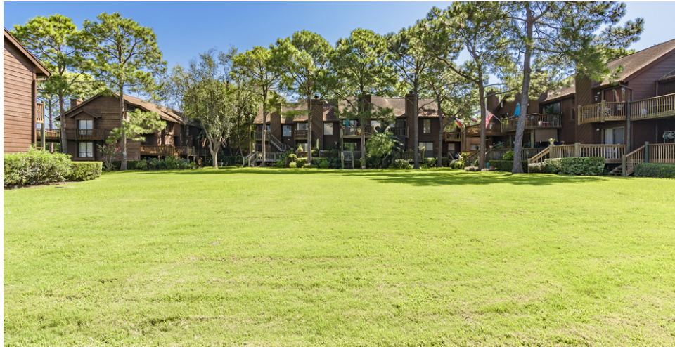
Phase 4 Site - (4) Townhome Lots