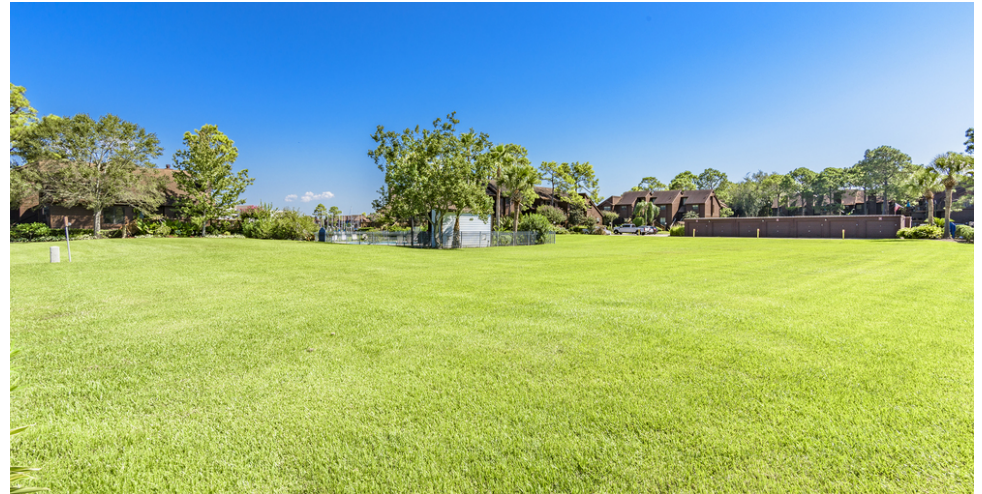
Phase 5 Site - (13) Townhome Lots