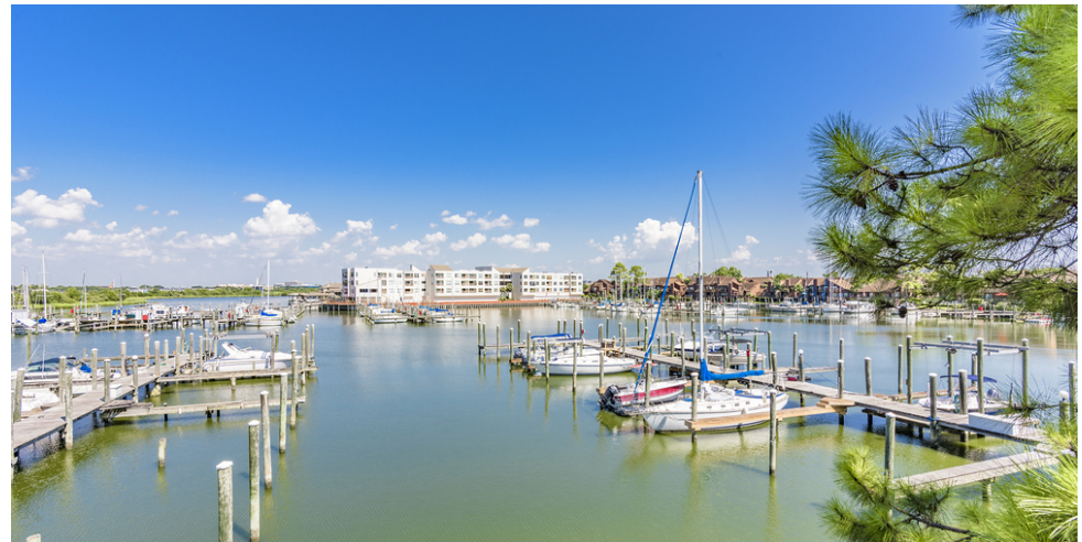
Marina Boat Slips - (12) Designated to Phase IV & V

KW COMMERCIAL 18050 Saturn Lane., Ste. 100 Houston, TX 77058