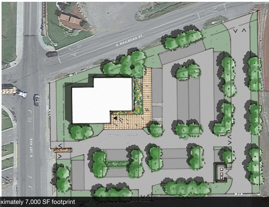
Single building with approximately 7,000 SF footprint