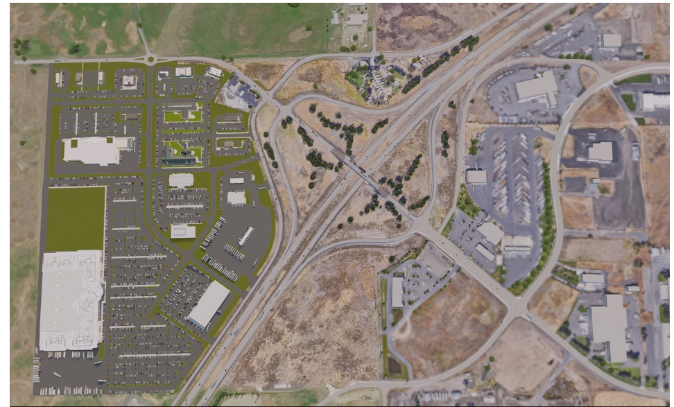
Draft Rendering- pending final BSP