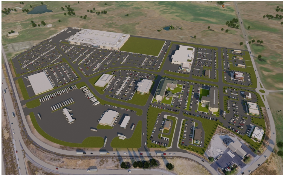
Draft Rendering- pending final BSP