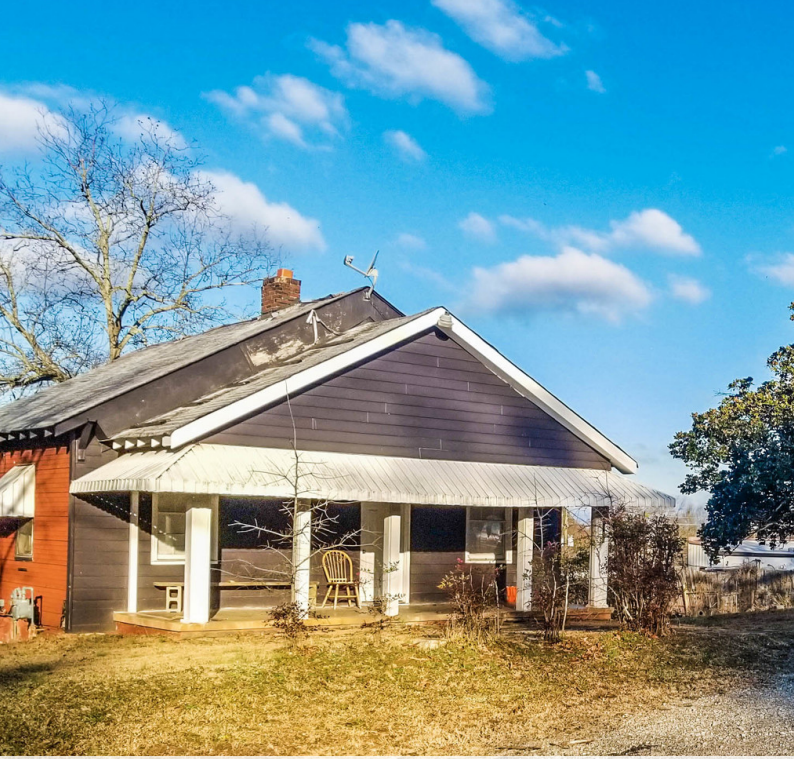
Existing ± 1,656 SF structure