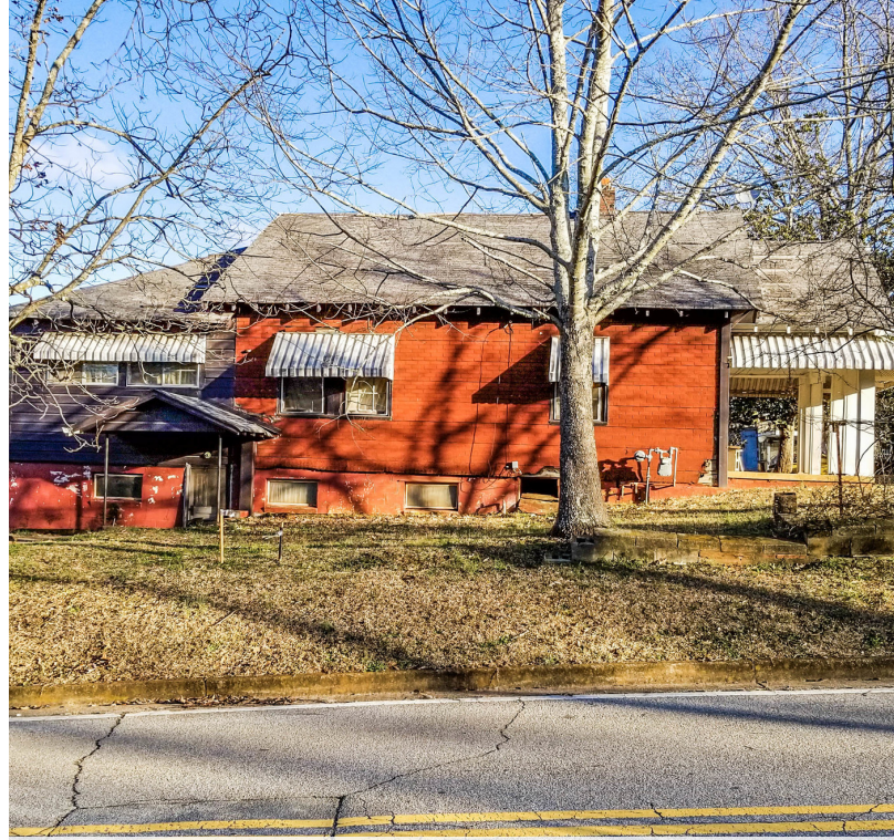
205' of frontage on Chestnut Street