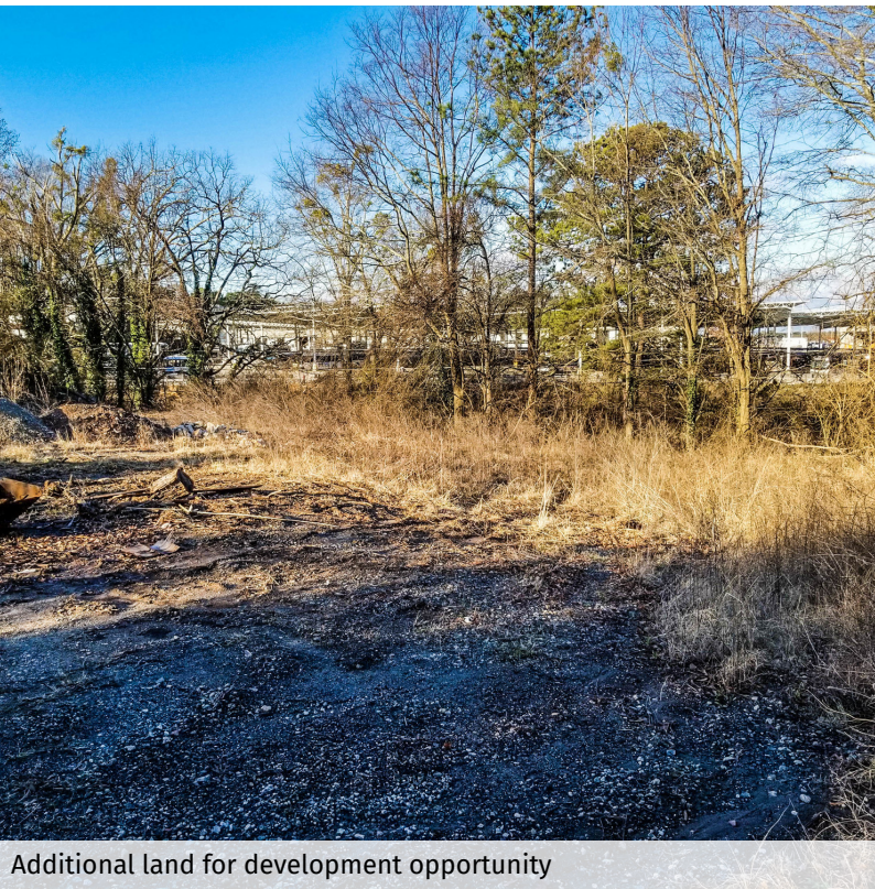
Additional land for development opportunity