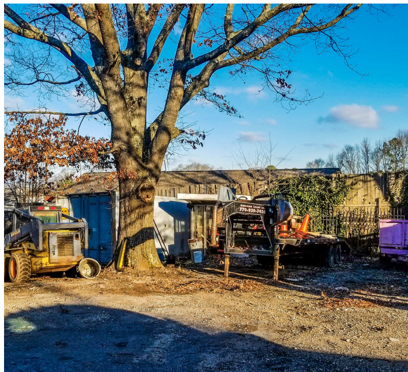
Zoned M allows for variety of industrial uses including outside parking and storage