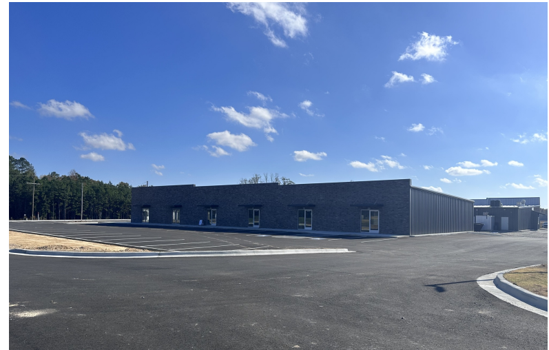
New Centers in place due to growth

NATHAN HUTCHINS O: 501.912.3660 nathan.hutchins@svn.com AR #PB00063530