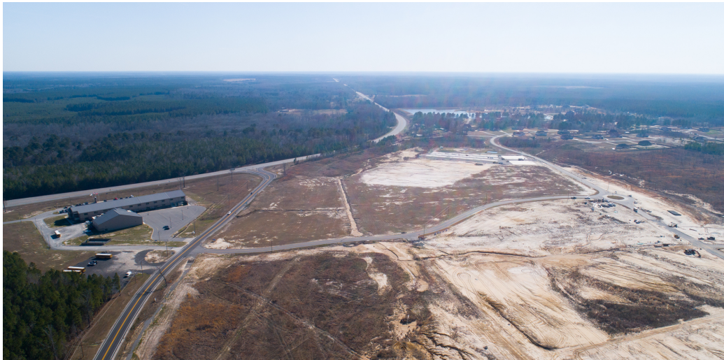
Aerial from earlier in 2024.