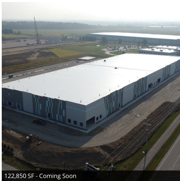
122,850 SF - Coming Soon