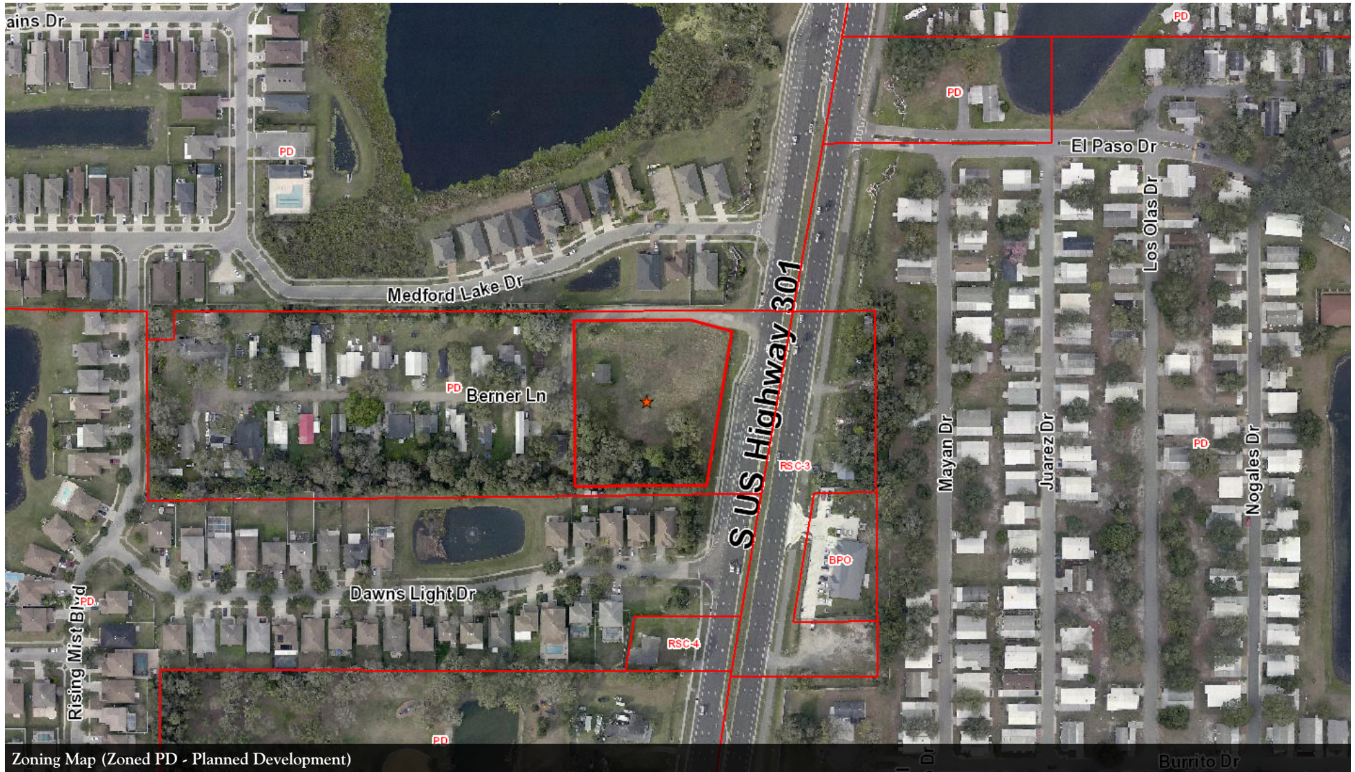
Zoning Map (Zoned PD - Planned Development)