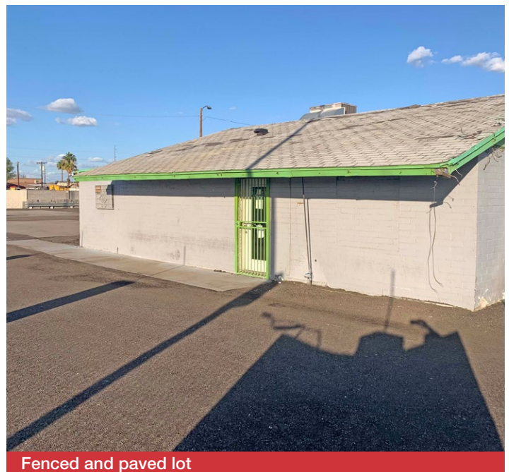
Fenced and paved lot