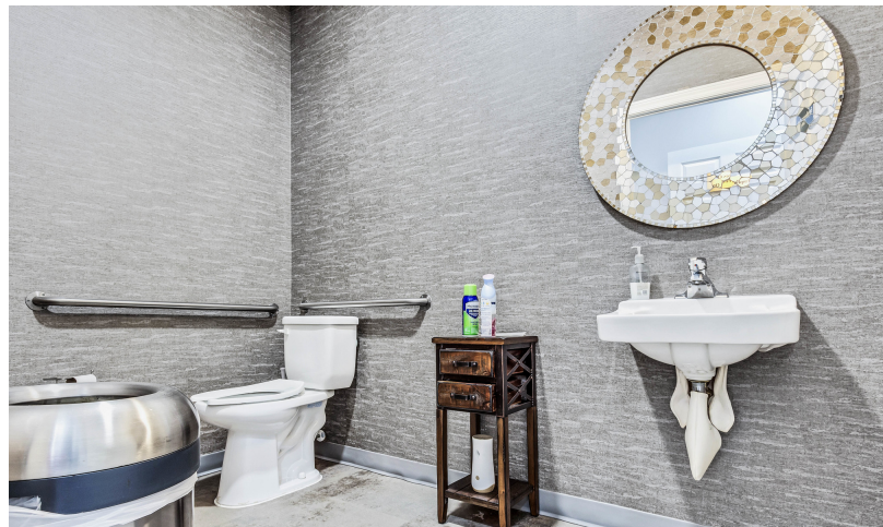
ADA COMPLIANT PRIVATE RESTROOMS