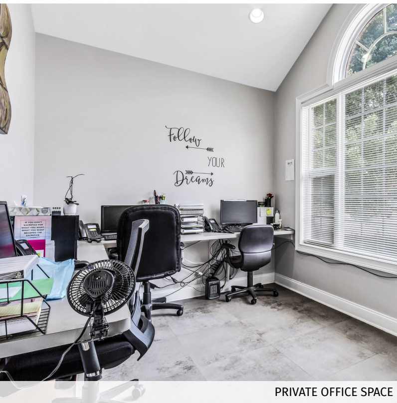
PRIVATE OFFICE SPACE