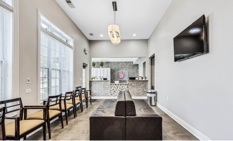
WAITING AREA & FRONT DESK