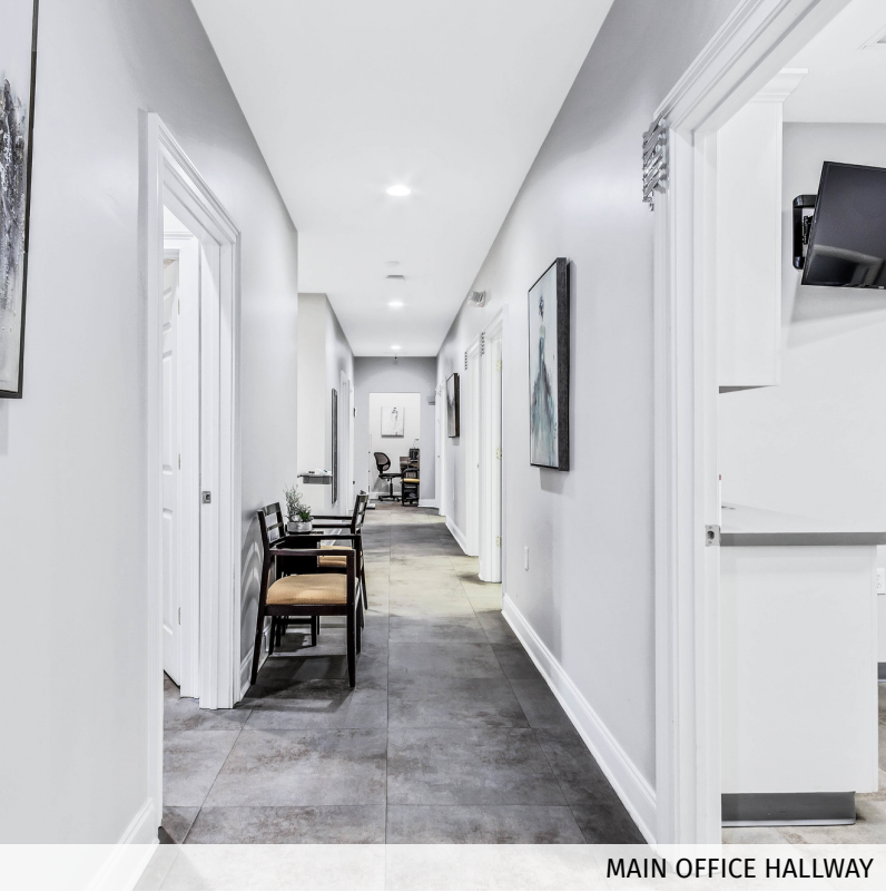
MAIN OFFICE HALLWAY