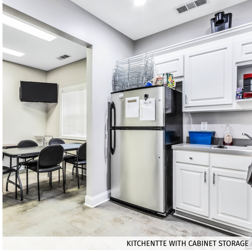
KITCHENTTE WITH CABINET STORAGE