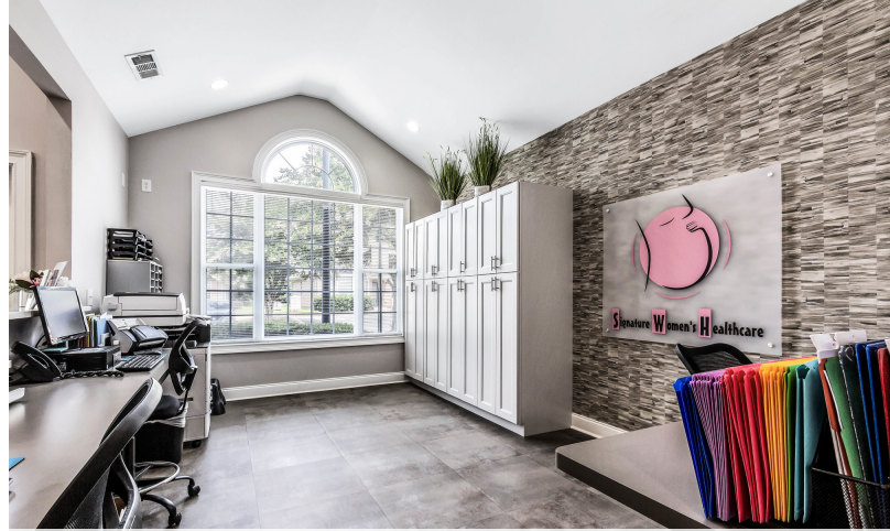
RECEPTION/FRONT DESK AREA