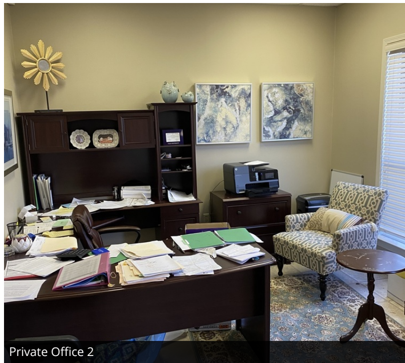
Private Office 2