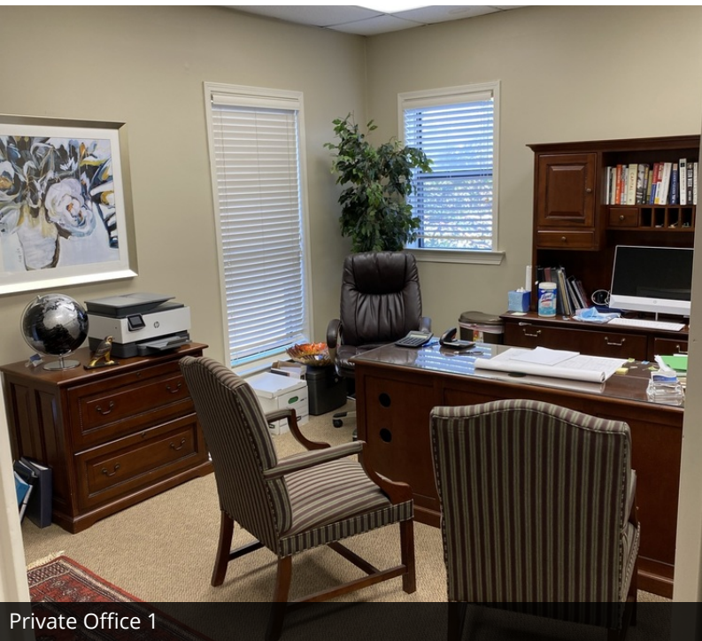
Private Office 1