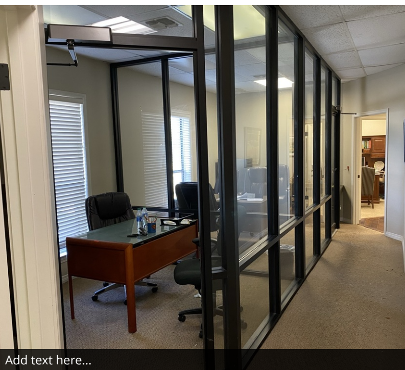
Add text here...