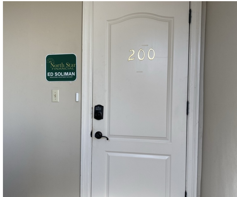
Suite 200 Entrance