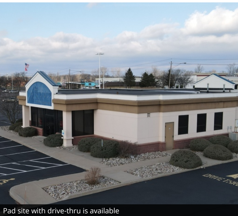
Pad site with drive-thru is available