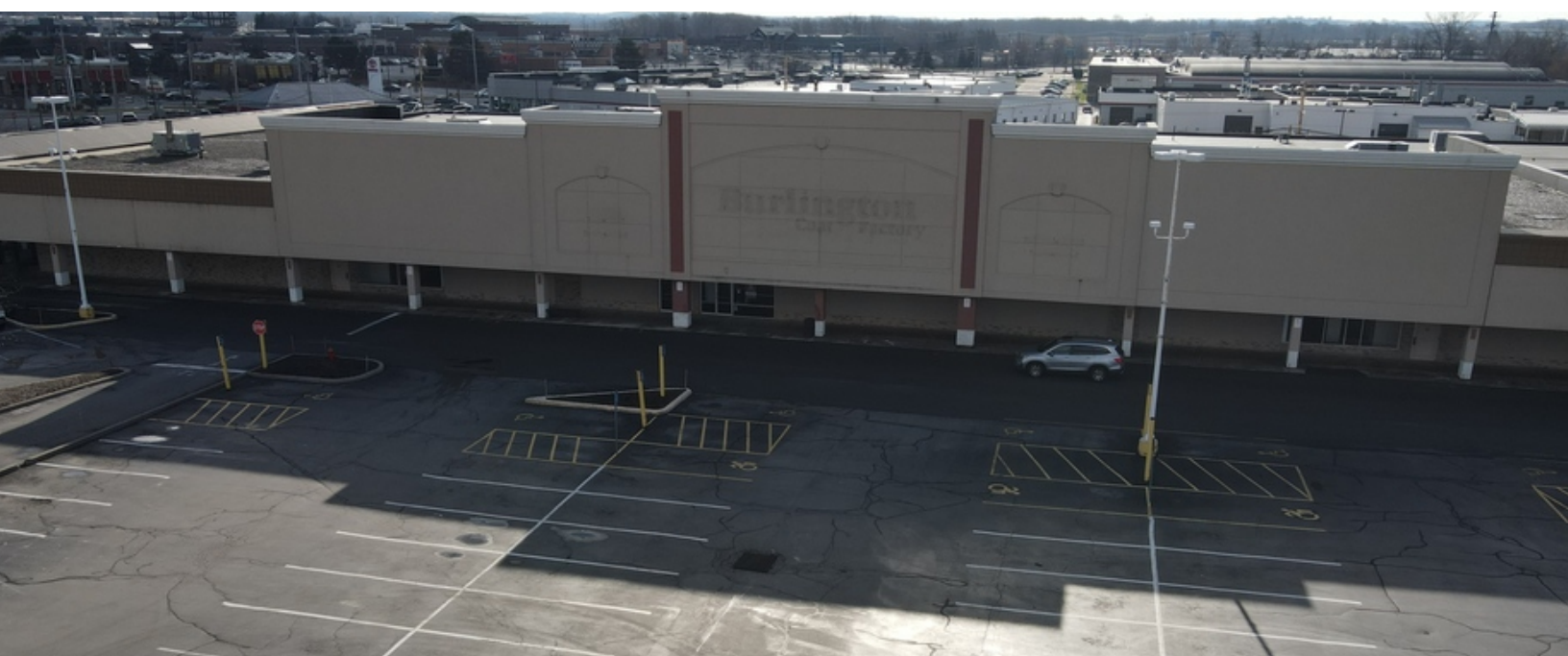
Big box space can accommodate a variety of concepts