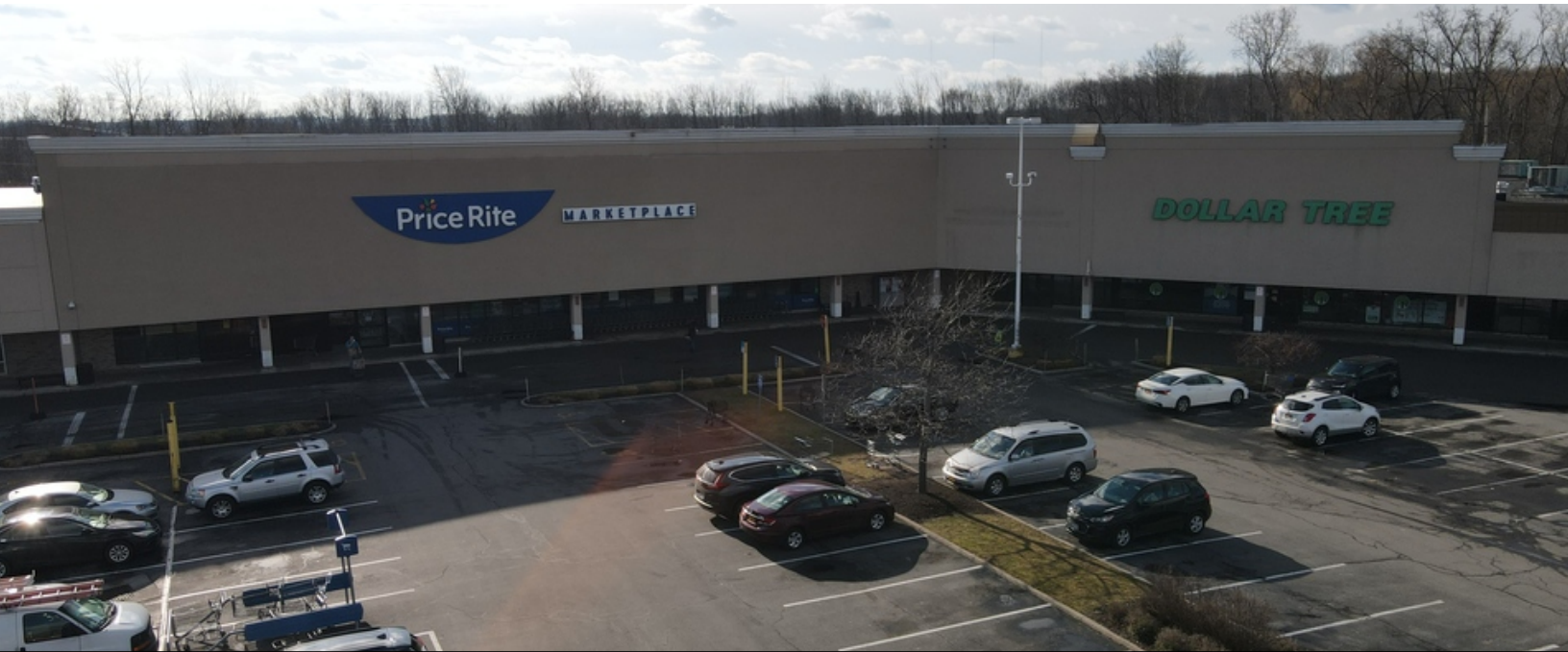
Grocery anchor tenant brings in regular visitors