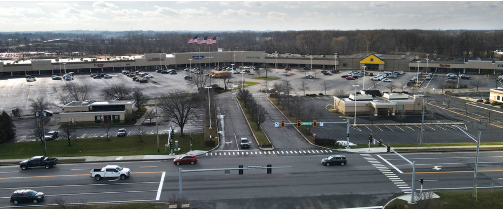
Signalized entrance with available pad sites