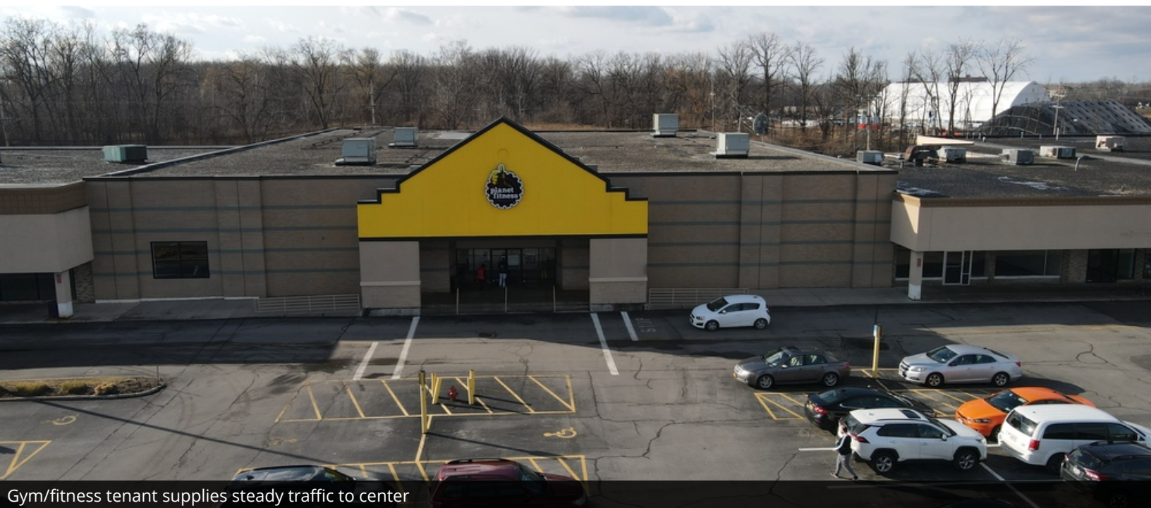
Gym/fitness tenant supplies steady traffic to center