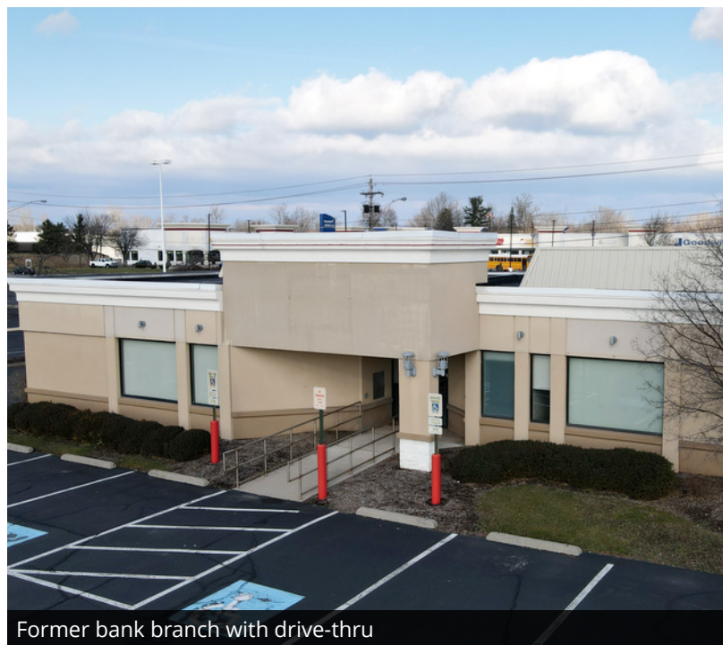
Former bank branch with drive-thru