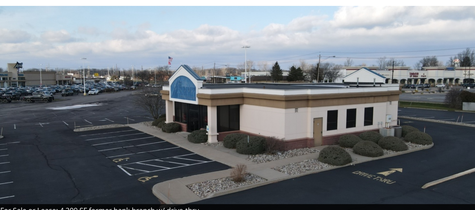
For Sale or Lease: 4,309 SF former bank branch w/ drive-thru