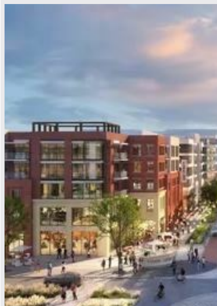
Artist rendering of the future DoubleBranch development at Interstate 75 and State Road 52

Double Branch Development Inc. has begun its first phase, including 2.5 million square feet of industrial and life sciences development and 100 acres of mixed-use development. When the overall project, previously known as Pasco Town Center, is completed, it is expected to generate $600 million in economic impact. The build out cost of the total site is expected to hit $2B, including 4M SF of industrial space, 725,000 SF of offices, 400,000 SF of retail, 3,500 housing units and 300 hotel beds.