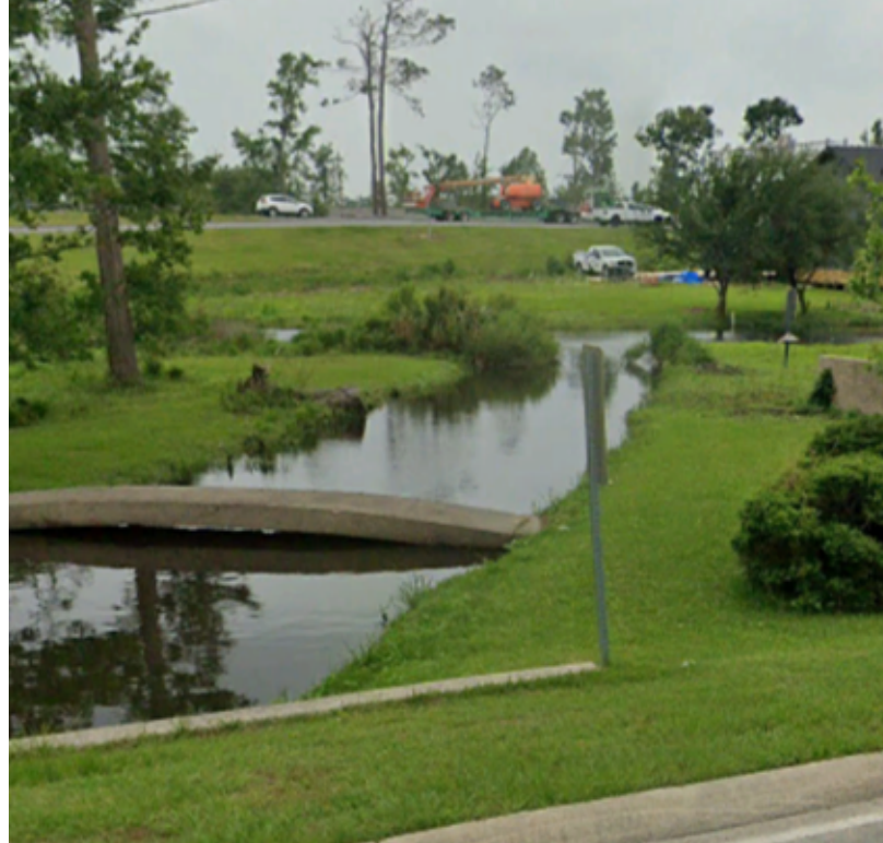
Foot bridge at the West end of the property