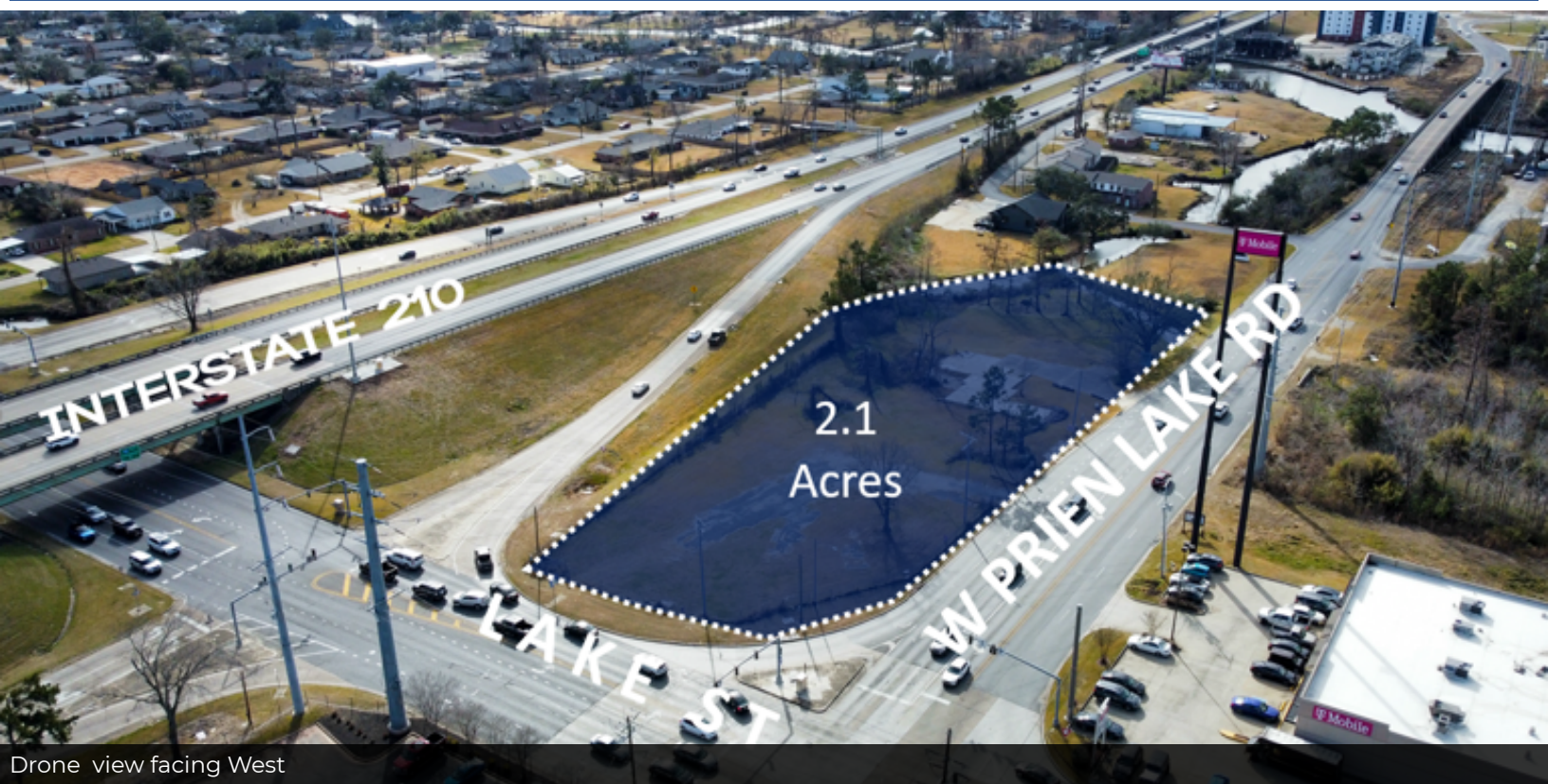
Drone view facing West

821 W Prien Lake Road, Lake Charles, LA 70601