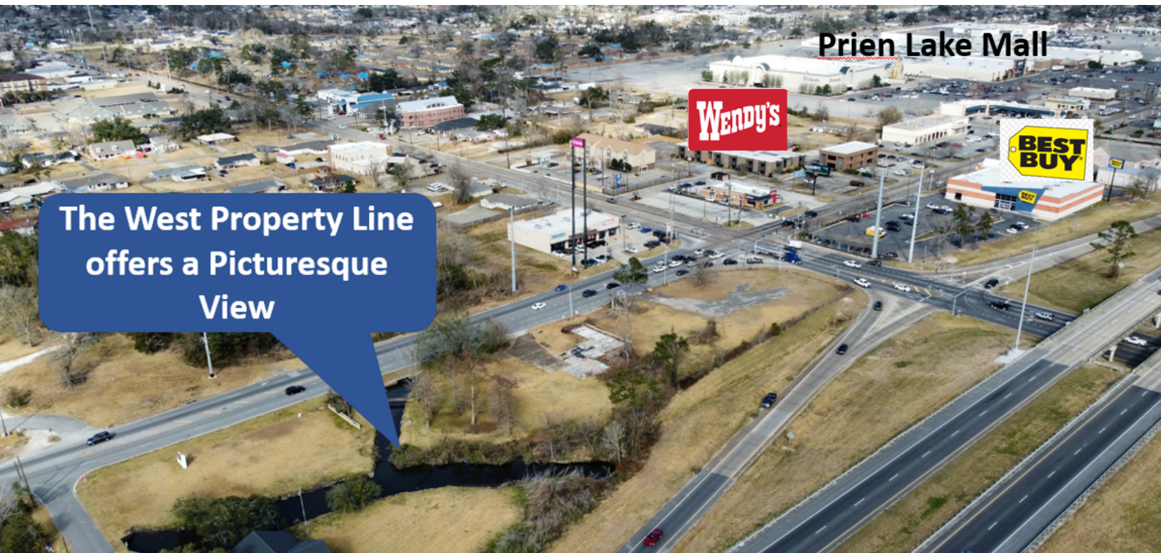
Drone view facing East/NE. Prien Lake Mall in background. Best Buy is directly opposite this property.