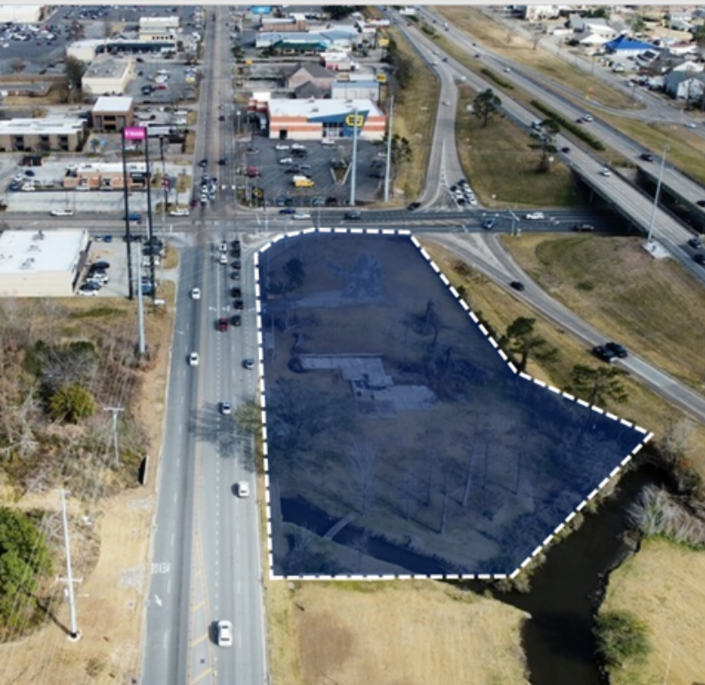
Drone view facing East on W Prien Lake Road

821 W Prien Lake Road, Lake Charles, LA 70601