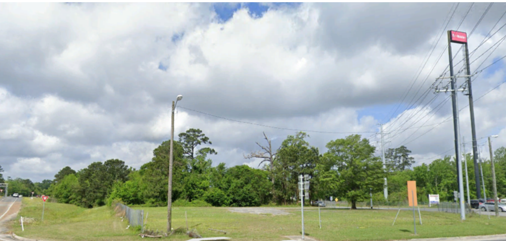
Ground level view facing West