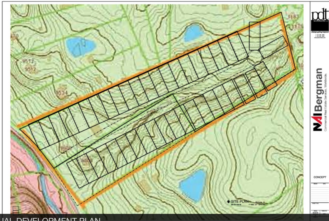
CONCEPTUAL DEVELOPMENT PLAN