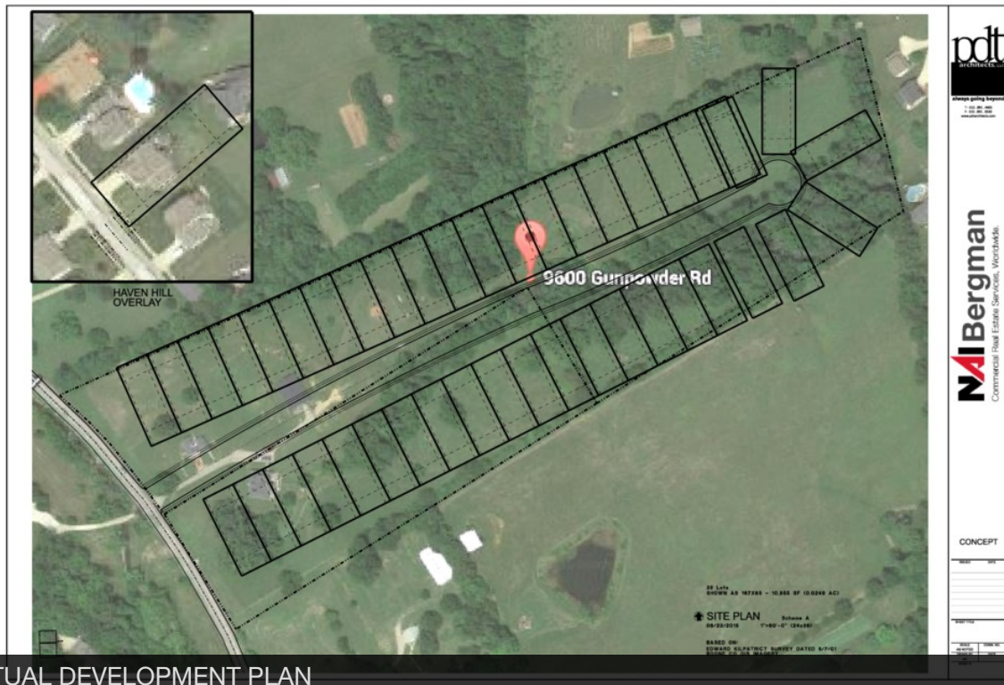
CONCEPTUAL DEVELOPMENT PLAN