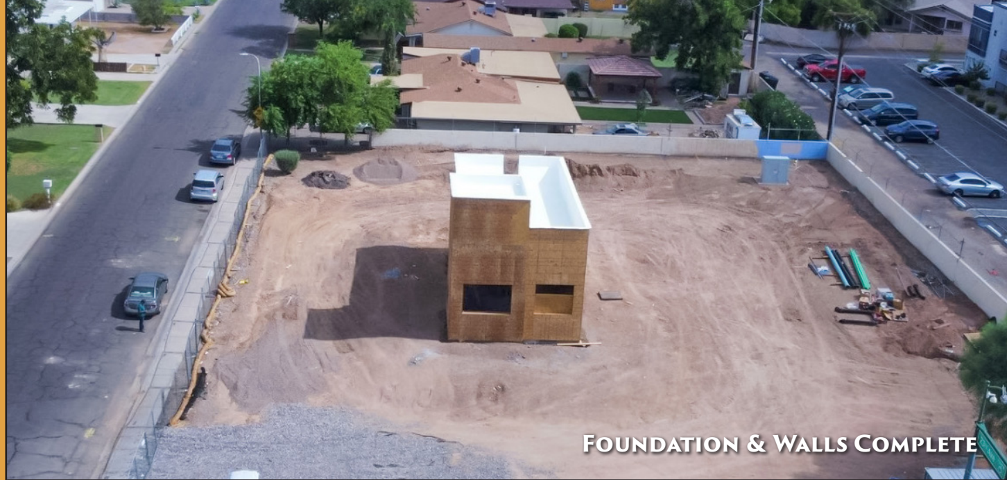
FOUNDATION & WALLS COMPLETE

ORION INVESTMENT REAL ESTATE SCOTTSDALE FASHION SQUARE 7150 EAST CAMELBACK ROAD | SUITE 425 WWW.ORIONPROP.COM