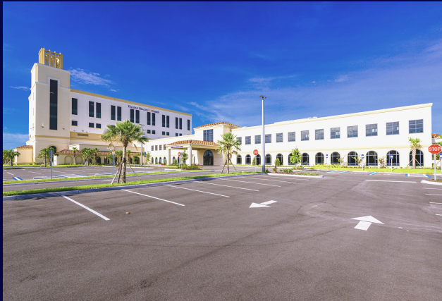
HALIFAX MEDICAL OFFICE BUILDING