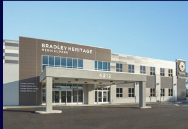
BRADLEY HERITAGE MEDICAL PARK