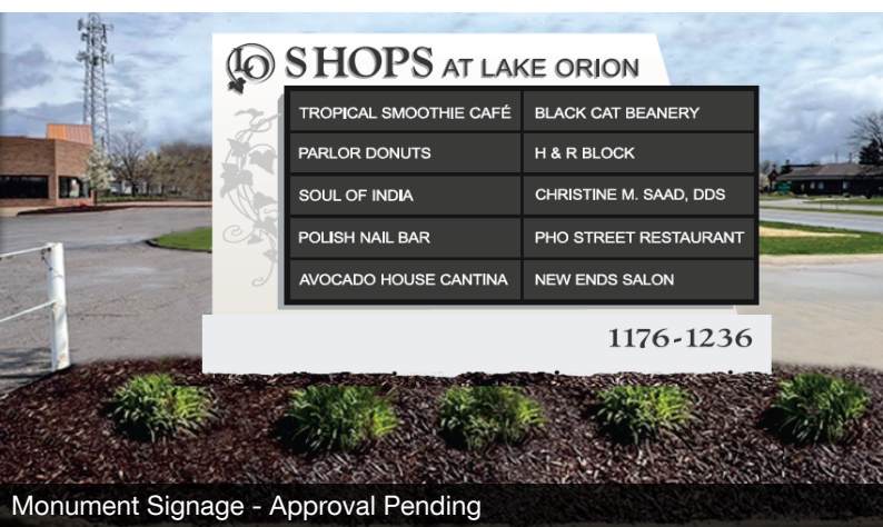
Monument Signage - Approval Pending