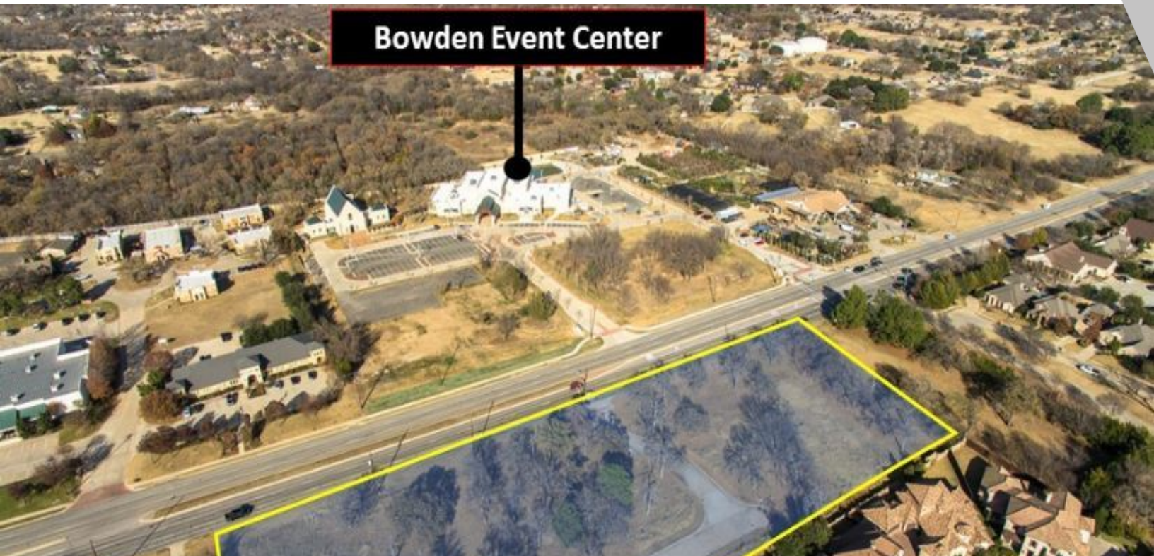
Bowden Event Center