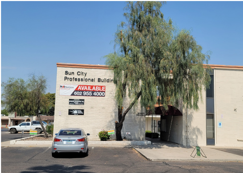
East facade + parking