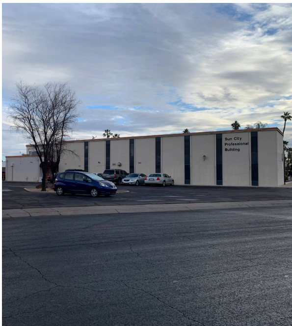
West facade + parking