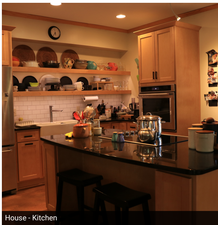
House - Kitchen