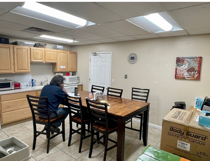
Large Kitchen/Break Area