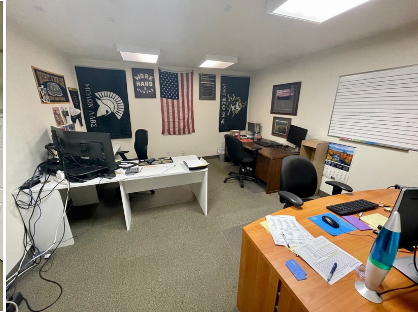
Large Private Offices