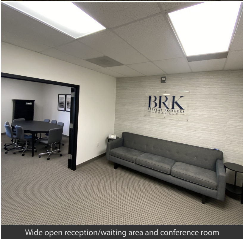
Wide open reception/waiting area and conference room