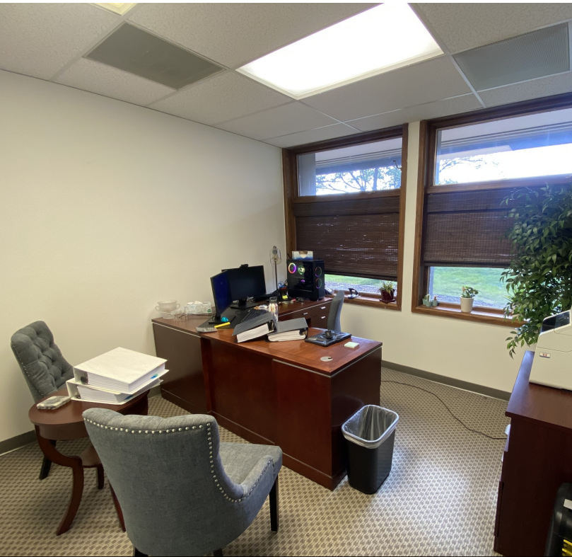
Most Private Offices Offer Ample Natural Light