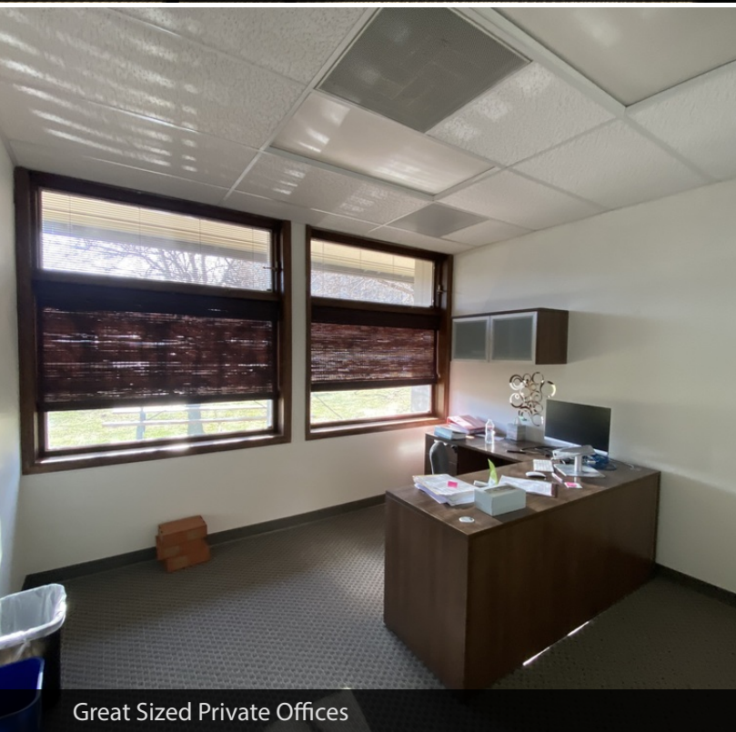
Great Sized Private Offices