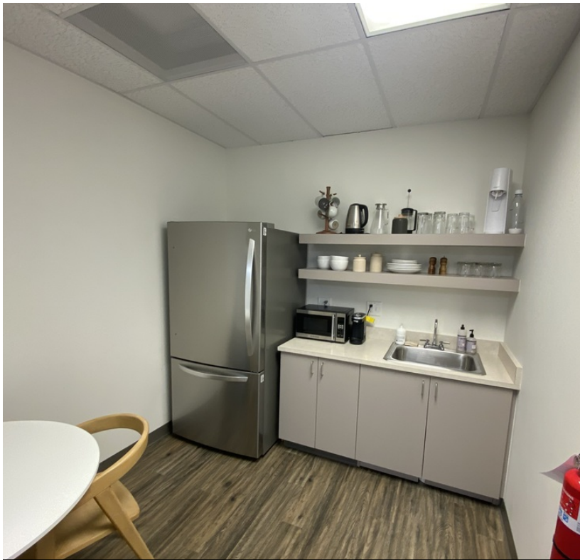
Room for a full size fridge, and water access in Break Area